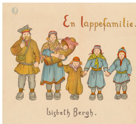
Figure 2. En lappfamilie , front cover. Copy from the National Library in Oslo.

Placing the child in the middle of the front page signals the child's central position in the book. This also indicates the child's prominent position in early children's literature, enabling identification for the child reader. Unlike the parents, the child in the middle looks away from the observer (the reader), and the moving body reminds the reader of a child's impulsive and restless nature. The four children (El (Ellen), Lars, Sigran, and Ane) are all represented on most of the spreads, illustrating how the oldest children contribute and assist in the daily work. Four-month-old Ane is usually positioned in her komse, while three-year-old Sigran «(...) toddles about with mother, for then she feels so safe, but once in a while she goes off by herself, for you know, there is so much to be looked after» (spread 3). Lars is six years old and active, while El (Ellen) is eight and goes to school three months a year. She is the one who helps the most with the everyday activities, usually in collaboration with her mother. The verbal text says little about whether the children have time to play, but in spread 8, the children's playful nature is hinted at when one of them appears to crawl under the tent canvas instead of using the tent entrance.