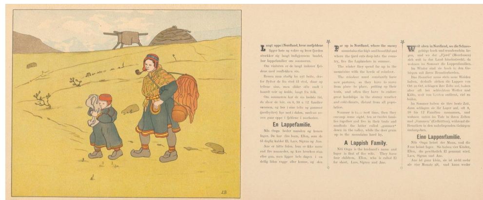
Figure 1. En lappfamilie , spread 2.