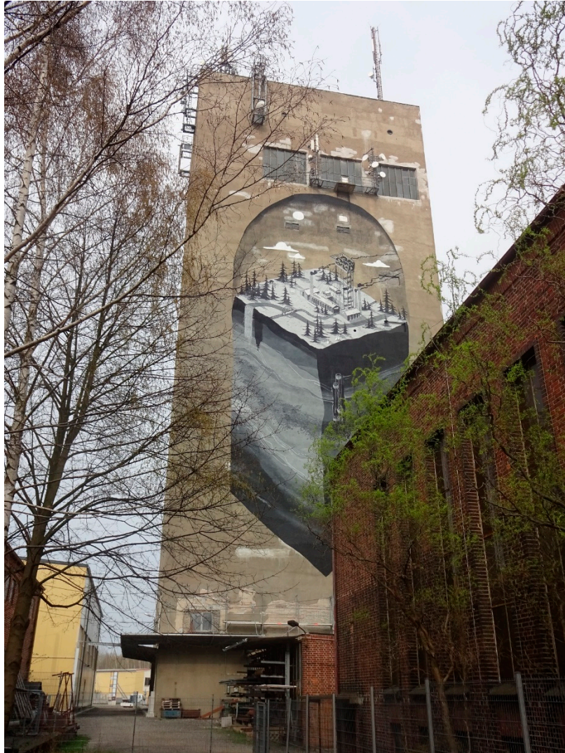
Figure 2. Tower of Martin-Hoop-Shaft, Zwickau.

Another cultural highlight has been an artistic intervention at the former mining shaft tower near the city of Zwickau. The installation became a widely recognized landmark in the area, displaying the industrial past of the wider region. The investment was realized after a design competition and with the support of a local company being present on the site of the mural. Due to the success of the funded action, a follow-up installation on the other side of the tower will be implemented at the end of 2019 with a focus on the industrial present and future of the region (see Figure 2).