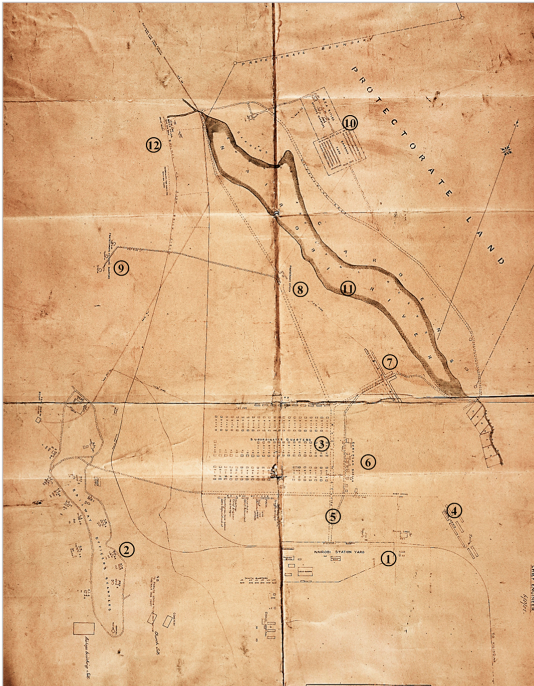
Figure 3. Development status of Nairobi as at 1901. Dated 6 August 1901, and signed by the Chief Engineer of the Uganda Railways.