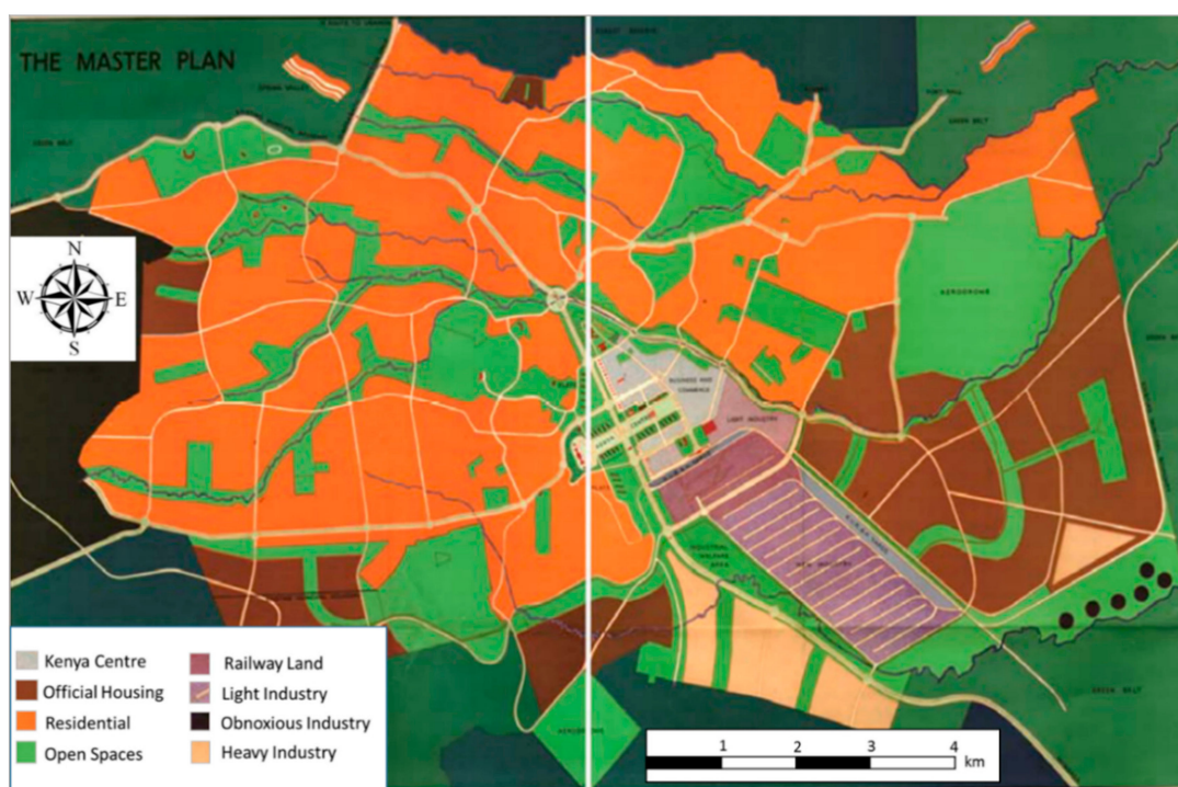
Figure 4. Nairobi Master Plan for a Colonial Capital.

objectives were: to provide areas adequate in size for residential, commerce and business, industry, public buildings, and recreation; to zone these areas to ensure their most efficient interrelationship; to organize traffic circulation on a rational basis, to design a system of interlinked spaces, and to increase civic consciousness. There have been varying views about the racial basis of the 1948 Master Plan, with most scholars alluding to the notion that it largely excluded the Africans, even though he formed the bulk of the population at the time. Emig and Ismail, who assessed the 1948 Master Plan, claimed that its political character was hidden behind the look of a technical document: ‘the basic common authoritarian outlook is preserved—albeit concealed behind the liberal façade of the plan’ [8] (p. 55). In the colonial period, what appeared as technical planning documents and policies had far-reaching impacts on the social and political operations of the city.