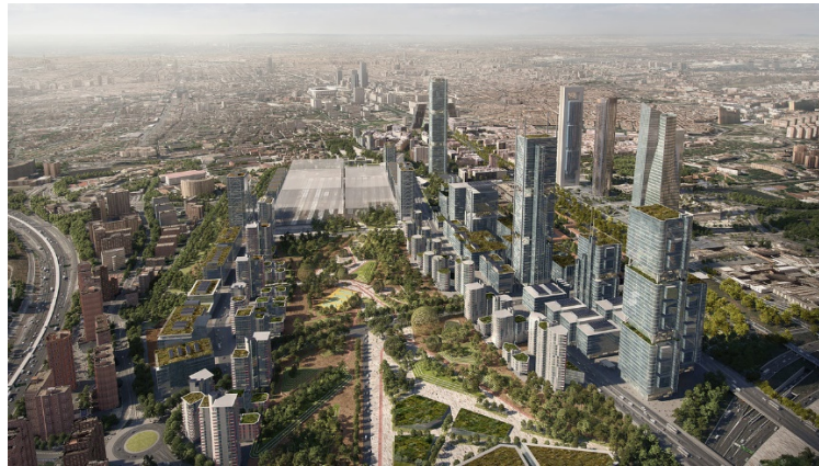
Figure 3. Recreation of the Madrid Nuevo Norte project (2020) [38].