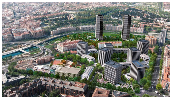
Figure 4. Recreation of the Mahou-Vicente Calderón project (2014) [42]. Copyright 2014 Laura Sánchez Carrasco and Rubio Arquitectura.

The Rubio & Álvarez-Sala studio of architects designed the project including 36-floor skyscrapers, 20-storey buildings and 8-floor residential blocks (Figure 4). The City Council publicised the timelines and the quality of the operation stressing its economic, social and environmental profitability, and for its contribution to creating a monumental, iconic residential area that would become a reference in Madrid, and named it La Nueva Puerta del Sur . Political parties in the opposition and the Contra el Plan Mahou-Calderón platform demanded its withdrawal, as it was approved without a legal settlement in the courts, and staged demonstrations to express their rejection: "No to the Mahou-Calderón operation. No to this policy of speculation!" and "This is no game; Arganzuela is not Manhattan!"