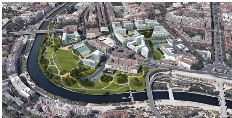
Figure 5. Buildings recreated in the Nuevo Mahou-Calderón proposal (2017) [47]. Copyright 2017 E.BARDAJI Y ASOCIADOS/ARQUITECTOS.

The Nuevo Mahou-Calderón project was drafted in record time. The landowners accepted the design with no skyscrapers and a smaller housing allowance. This gave rise to the process for a further modification to the PGOU and a new Partial Plan. The City Council conducted a restricted call for bids from urban planning professionals to address a new distribution of the area that was awarded to the architects Enrique Bardají y Asociados S.L. This new proposal was presented at the negotiation table made up of citizens' groups, professional associations of architects and engineers, and political parties with municipal representation. The new urban players criticised the high floor-space ratio agreed between the owners and the council, as this undermined the effectiveness and adequacy of the participative process. Nevertheless, they acknowledged the improvements made and proposed, among other measures, spreading the buildable space to balance the height of buildings, enhancing aesthetic aspects and ensuring better sunlight exposure conditions [44,45]. These demands were included in the report given final approval by the regional government [46] and in the applicable urban regulations (Figure 5).