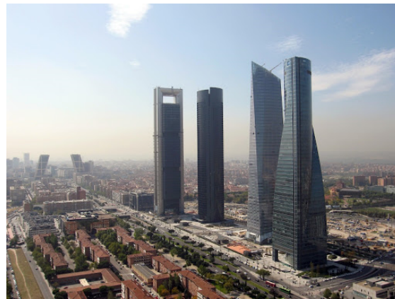
Figure 2. View of Cuatro Torres from the northern Paseo de la Castellana [34].

The enclave was thus consolidated as the city's leading business complex and international trading centre. The towers, ranging from 49 to 56 storeys high, dominate the Madrid skyline (Figure 2).