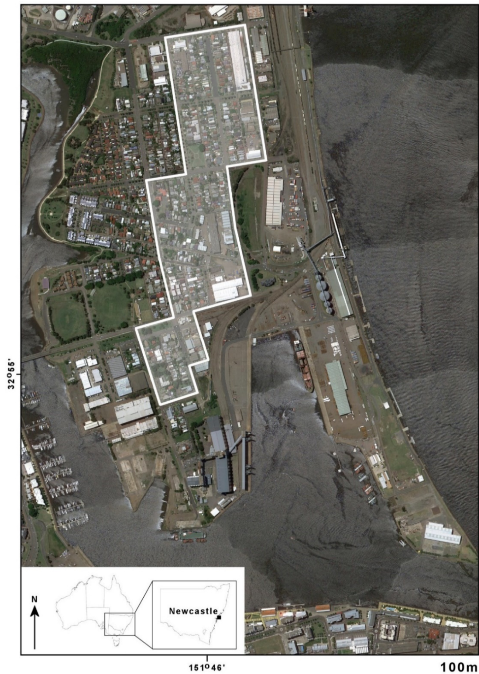
Figure 1. Residential and industrial areas where property surveys were conducted within the suburb of Carrington, adjacent to the Port of Newcastle, NSW, Australia. (Image: Google Earth; accessed 28 August 2020.).

laboratory for identification while pupae were collected and returned to the laboratory and placed in specialised containers (Australian Entomological Supplies, Bangalow, NSW) to allow emergence. Immature specimens were identified according to the taxonomic key of Russell [40] and pictorial guide of Webb et al. [27]. Climatic data for the survey period were obtained from the Bureau of Meteorology (Station ID: 061055, Newcastle Nobbys Signal Station). For each of the property classifications, the mean number of containers was calculated and one-factor analysis of variance (ANOVA) was used to determine the significance of any differences.