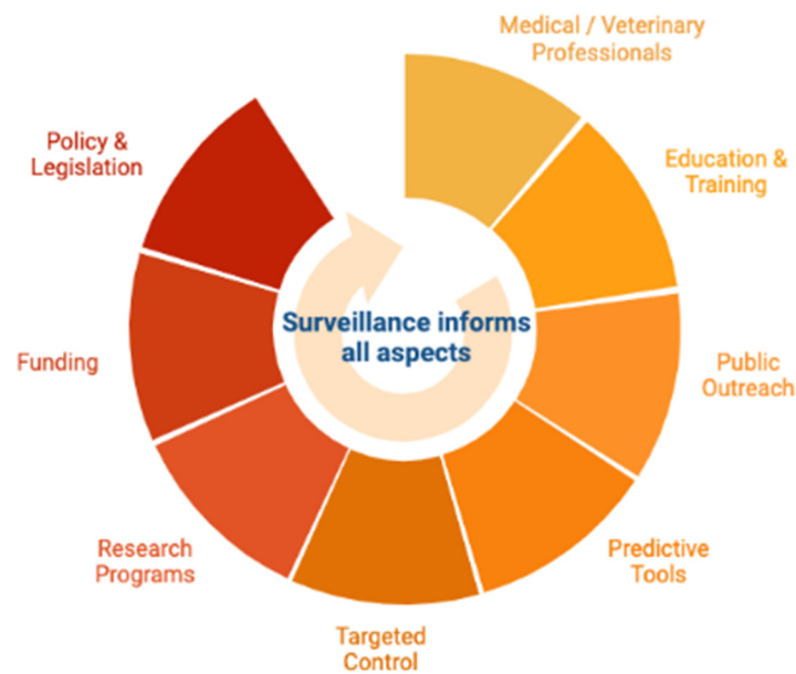
Figure 3. Effective tick control requires continued surveillance and adaptive control, management, and education to fit the current and predicted future needs of the populace (figure created with BioRender.com ).

Models have shown conflicting results on the effects of climate change on tick distributions and tick-borne disease risks, as can be expected with complex systems, and have shown much broader habitat suitability than current species records indicate in many cases [54]. Additionally, macro- and micro-habitats are critically important in interpreting and extrapolating model predictions. For instance, models in Canada have shown the importance of warmer, milder winters in the range expansion of I. scapularis . In contrast, models in the northeastern U.S., where Lyme disease is endemic, have not detected a significant effect of weather conditions on tick densities in the following years [95]. There are numerous varied and complex differences between these two systems, but the difference in importance of a critical predictor such as temperature highlights the caution needed for extrapolating results to different habitats, and particularly within policy and control applications. Models used in combination with long-term classical surveillance have been effective in developing control and management strategies in public health contexts, as evidenced by I. scapularis range expansions in the U.S. and Canada [54,59,96], as well as within veterinary health contexts, such as in Rhipicephalus spp. in cattle-wildlife grazing systems in Kenya [97–100].