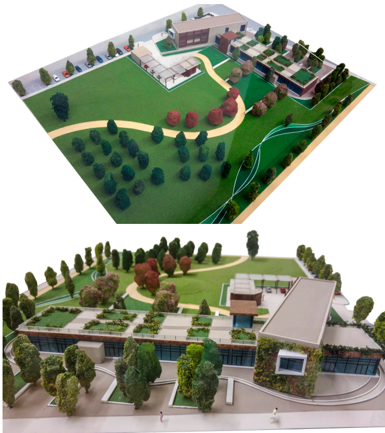
Figure 2. Physical model of the design project of the Milan Smart City Lab. The building is now in the executive design phase, while the open space still do not have a defined design project.

In the course of Architectural and Urban Simulation we tested the use of such an approach with the class. Students from the courses of study of architecture and planning developed a design project for the open area behind the Smart City Lab of the Municipality of Milan , in via Ripamonti 88, that will be built in 2018 (Figure 2). This will be a new public facility located in the south Milan, that will mainly host temporary co-working activity and will be an incubator for startups dealing with smart and sharing city solutions. The Smart City Lab and its open space will cover a total area of around 2 Ha; since this is a public facility, students were allowed to conceive the entire land as a public service.