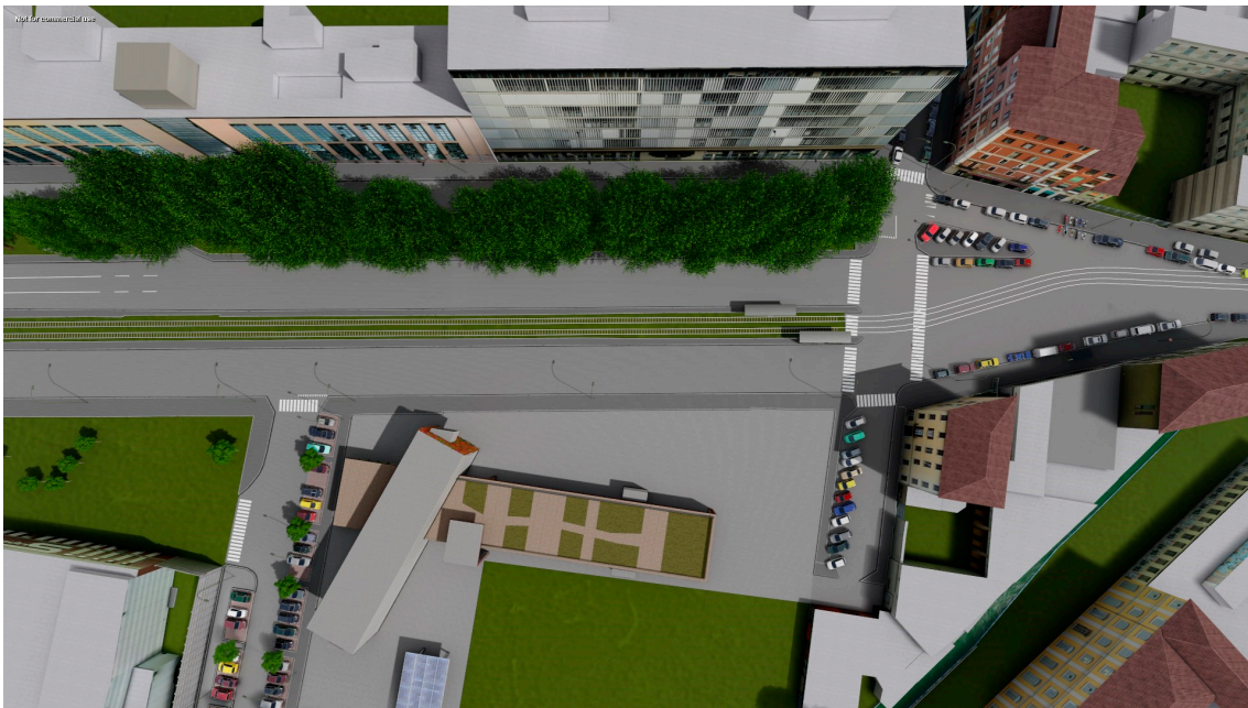
Figure 1. Render of the 3D model provided to students.

visualizations (Figure 1). We decided to use this tools because they are easy to learn and to use despite enabling high quality results in a short time. The limit of this choice is mainly related to the visualization style of Lumion®, that is peculiar and recognizable and produces visualizations that are too clean and pleasant. The modification of this fancy style is difficult to avoid, and this of course can incur a sort of bias if abused. For this reasons we tried to control this effect and we embedded the styles in the model as a reference for students. With this software it is very easy and fast to save spherical panoramas that can be presented using an HMD. Even in the choice of these devices we followed the same strategy as for software; we used cheap Cardboard where it is possible to insert smartphones of different sizes for visualizing the simulations in an interactive way. The same panorama produced for HMD can be visualized and navigate directly in the browser of the desktop pc or of mobiles. It is important to remark that the use of this tools has been intended as iterative to support the typical non-linear design process for more details on the approach adopted see [3].