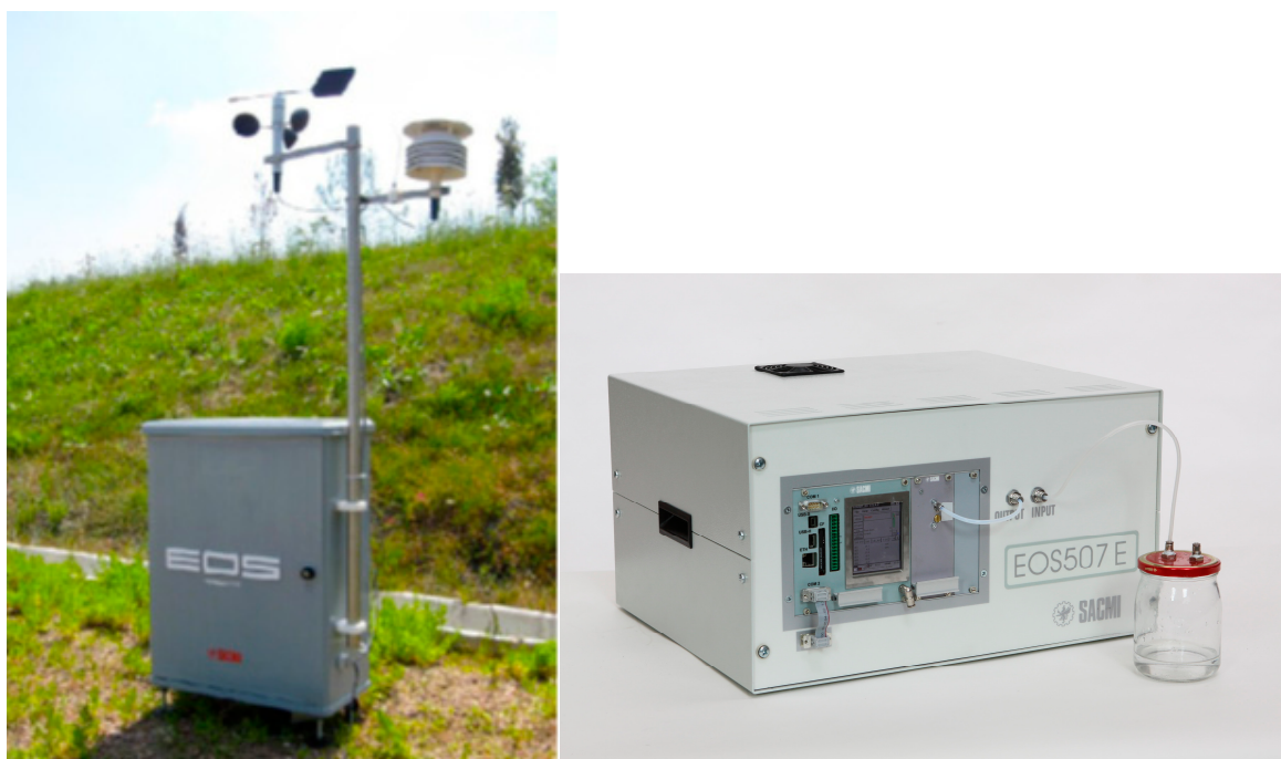
Figure 2. SACMI Electronic Olfactory Systems for outdoor (left) and laboratory (right) use.

As a result, these instruments can be used reliably both in laboratory for quality control measurements and outdoor for continuous environmental monitoring of odour nuisance (Figure 2). In the past years, SACMI Electronic Noses have been applied in food quality control (coffee, olive oil, tomato, etc.), packaging quality control, and monitoring of industrial activities (refineries, waste treatment plants, chemical plants, etc.).