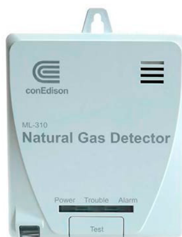
Figure 2. Final Product.