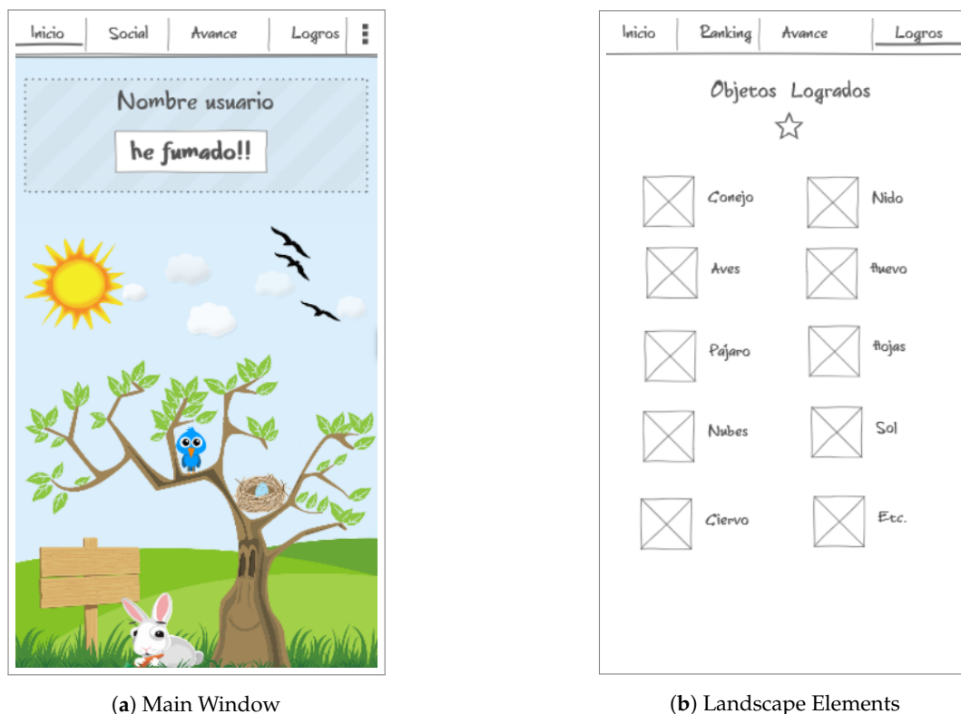
Figure 1. First version Mockups of Evitapp