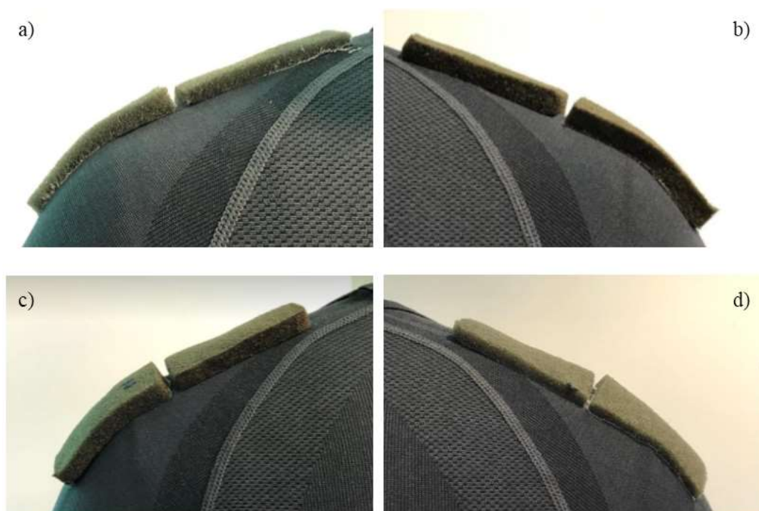
Figure 2. Images of the prototype garment, (a) front view conventional foam; (b) front view auxetic foam; (c) back view auxetic foam; (d) back view conventional foam.

The quantified results from the three tests, presented in Table 2, indicate that the auxetic foam sample was able to retain its depth whilst subject to tension when fitted to a mannequin. In contrast the data shows that conventional foam was found to decrease in depth under tension and failed to recover its original depth from one test to the next. The results are also recorded as images in Figure 2 which offer a visual contrast between the conformability of the auxetic samples (images B and C) and the thinning conventional samples (images A and D). This conformability is highlighted through the front depth and back depth of the samples. The results confirm that the auxetic samples are able to offer enhanced conformability in combination with a stretch sports top than the conventional counterpart.