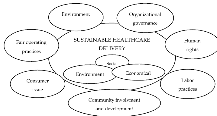
Figure 2. Pillars of sustainable development and ISO 26000 social responsibility core subjects.

The reference framework should consist of several matrix assessment tools that will be structured in line with the DUQuE project results [18]: (1) Accreditation of healthcare services, (2) The effectiveness of the organization’s management, (3) Continuing medical education, (4) Patient safety culture, (5) Computerized support systems for clinical decisions, (6) Dissemination and implementation of guidelines, (7) Actions to improve transfers, (8) Patient-centered care actions, (9) Six Sigma and Lean, (10) Performance information, (11) Audit and feedback, (12) Reporting incidents to the hospital, (13) Safety checklists, (14) Documentation internships etc.