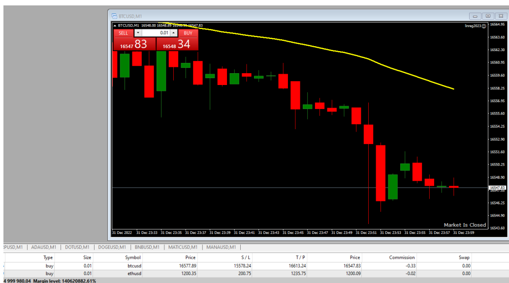
Figure 3. Genetic algorithm (GA) function for cryptocurrency.

Cryptocurrencies are different from other investments because they are very risky and can be very volatile. Before trading, it is important to have a plan and be prepared for the risks. You should also focus on technical analysis to understand the market. Figure 3 shows the use of automatic trading and investing based on a genetic algorithm to reduce loss risk. Table 3 shows that the use of a statistical model is important for validating that a genetic algorithm can analyze cryptocurrency data.