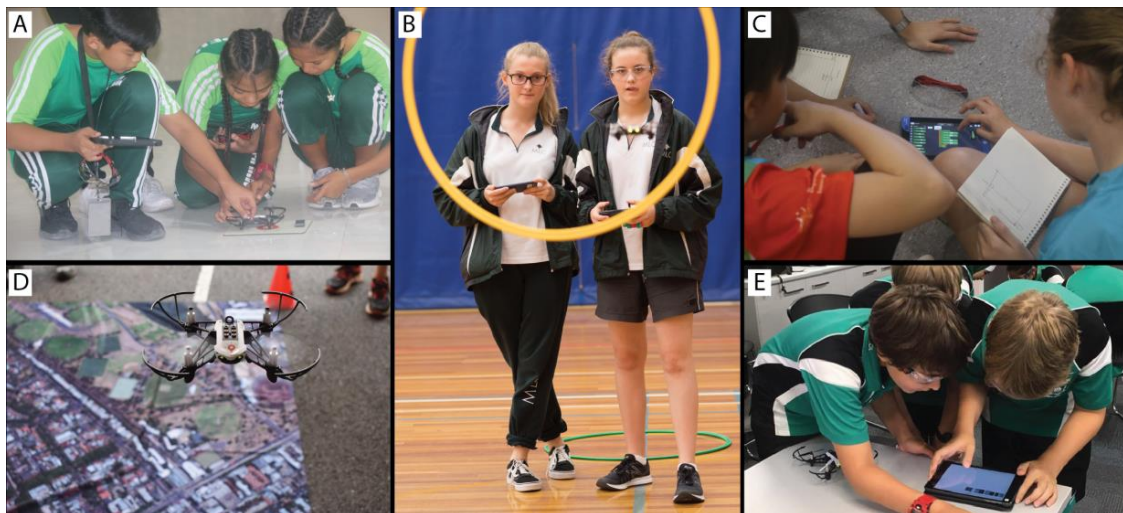
Figure 2. Students work in ‘crew’ to (A) conduct safety checks on their drone with an predefined checklist on their tablet; (B) practice manual flight skills; (C) design a mapping solution with corresponding block coding to survey a hypothetical natural disaster site; (D) test their code over the survey site, represented by a satellite image printed on a 2 × 2 m cloth mat; and (E) evaluate their results.

Over the course of 2.5 h, we encourage students to imagine themselves as geospatial scientists and professional drone pilots first on the scene of an area impacted locally relevant natural disaster. They then use a minidrone (e.g., Parrot Mambo [39] or DJI Tello [40]) to capture data (photos) to document the extent of the damage to share with a hypothetical local authority. In ‘crew’ of three, they are given rotating roles of the pilot in charge, co-pilot, and chief reporter. These roles are designed to mimic job requirements on a mapping mission, and are deliberately incorporated so that students can imagine themselves as a scientist rather than concede to the common ‘white lab coat’ stereotype of the profession [41]. Together, the students work in their crews to conceptualise the problem and apply their knowledge to design a mapping solution, using experiential learning [42]. Importantly, all students are actively involved in flying and programming their drones, rather than passively observing (Figure 2).