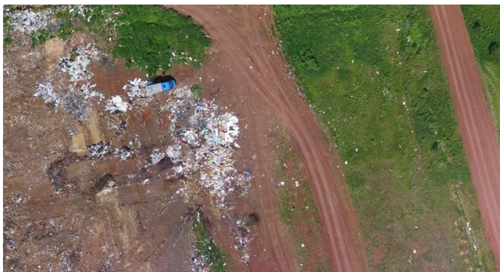
Figure 2. Contamination of the territory adjacent to the MSW dump “I” (Perm Region, Russia) with light fractions of waste due to their spread by the wind. Orthophotoplan fragment.

significant advantage over space imagery due to its detail. Such contamination, even with ultra-high resolution, is usually not distinguishable on satellite images.