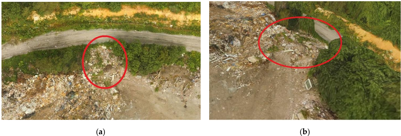
Figure 7. Collapse of the landfill slope at the MSW landfill “Ch” (Perm Region, Russia): (a) Fragment of an orthophotoplan; (b) Fragment of a 3D model.