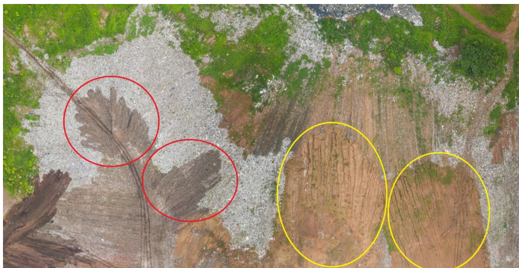
Figure 1. Containment of waste with soil at the MSW landfill “S” (Perm Region, Russia). Orthophoto-fragment. Areas with a newly laid soil layer are highlighted in red; areas with an old soil layer are highlighted in yellow.

Unmanned aerial imagery allows the control of the implementation of an intermediate insulating cover on the landfill. Figure 1 shows the containment of MSW with soil at the MSW landfill “S” in the Perm Region, Russia. Areas with a newly laid soil layer (circled in red) are clearly visible and stand out against the background of fresh waste. Images of areas with an old insulating layer, which was laid about a year ago (circled in yellow), are also interpreted; they clearly show the elaborated channels of small streams and traces of surface runoff.