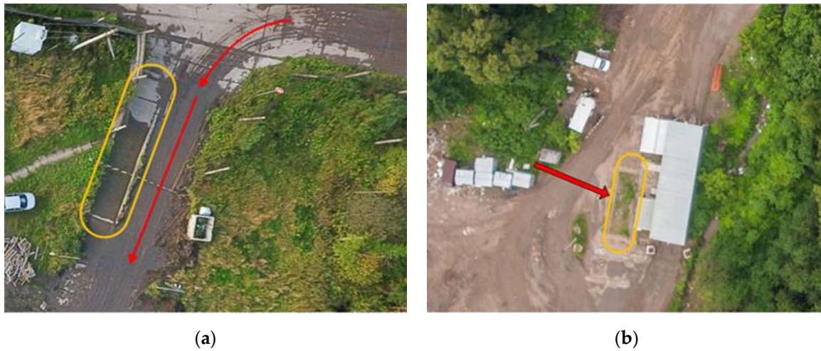
Figure 3. Unused reservoirs for washing wheels at the MSW landfills (Perm Region, Russia). Fragments of aerial photographs: (a) Landfill “Z” (reservoir for washing wheels is highlighted in yellow; red arrows indicate the actual direction of garbage trucks movement); (b) Landfill “S” (reservoir for washing wheels is highlighted in yellow).

the wastewater into special containers or storage ponds. Local treatment facilities can be installed at the WDS, or the runoffs can be transported to third-party treatment facilities.