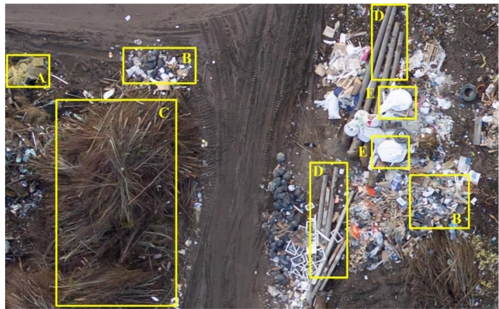
Figure 8. Qualitative determination of the waste type on the territory of dumpsite “B” (Perm Region, Russia): A—Thermal insulation waste, B—Household waste, C—Waste from cleaning the territory (cut off branches), D—Parts of reinforced concrete structures, E—Bags with construction waste. Fragment of aerial photograph.