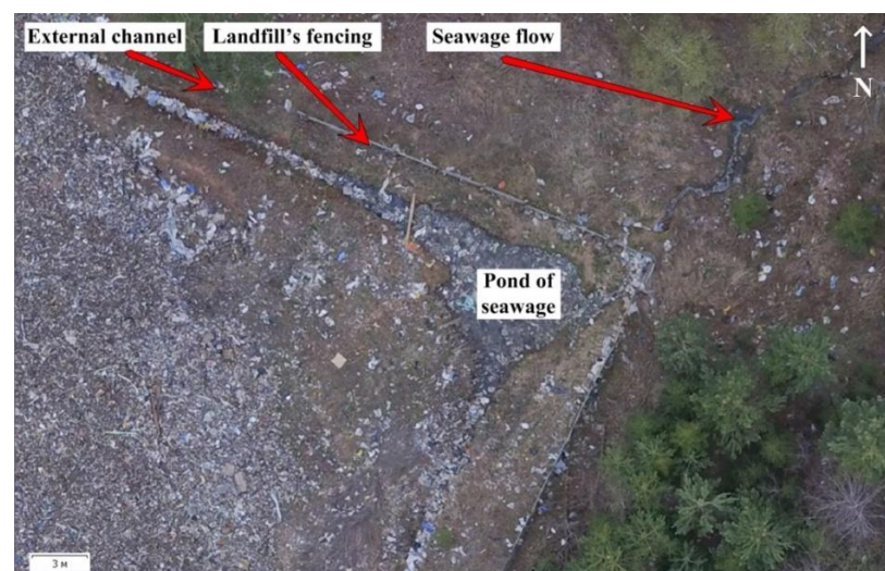
Figure 4. Wastewater leakage from the MSW landfill “N” (Perm Region, Russia). Orthophotoplan fragment.

Figure 4 shows an example of wastewater leakage detection from the territory of the MSW landfill “N” in the Perm Region, Russia. The figure clearly shows the drainage canal along the perimeter of the waste heap. Surface runoff and landfill leachate are collected in a canal and enter a small storage pond located in the corner of the fenced-in area. The orthophotoplan shows that the pond is overflowing, and the runoff flows out of the landfill territory through a small hollow and goes into the adjacent forest. The water surface of the canal and pond is heavily polluted with waste; some of it, together with runoff, is carried downstream of the watercourse, thereby polluting the underlying lands. This leakage is indistinguishable in publicly available satellite images.