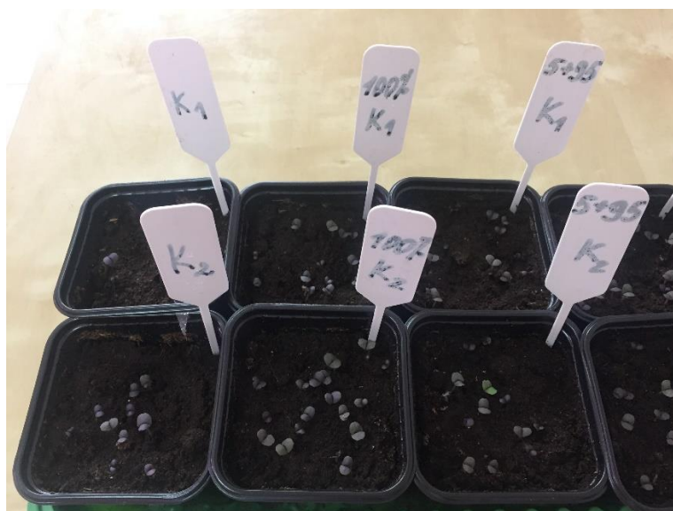
Figure S1. The initial stage of basil vegetation.

After being used as a substrate, all PLA/NR agrofabrics became brittle. It is impossible to determine the mechanical properties of such samples.