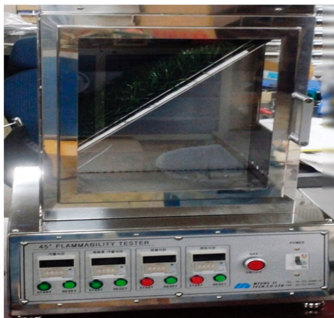
Figure S1. 45°-flammability combustion tester image