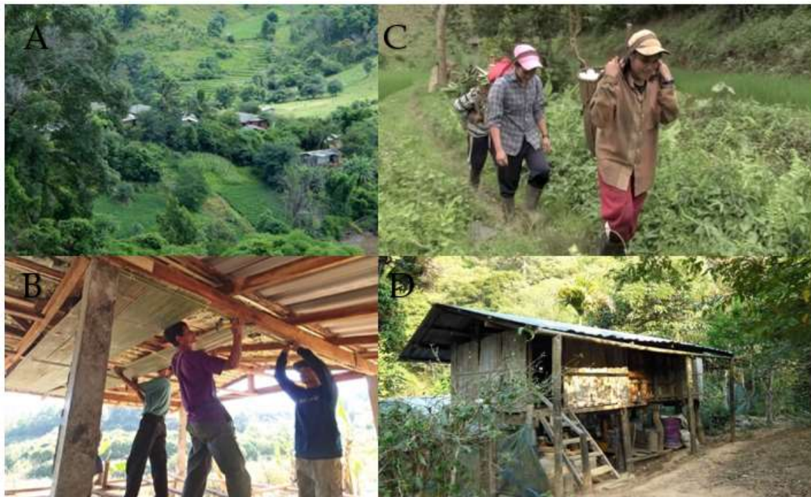
Figure 2. Lives of indigenous people at Ban Huai Hin Lat Nai in Chaing rai. (A) Houses are protected by tropical rainforest. (B) Houses being built by villagers. (C) Self-sufficiency and cultivation while protecting the forest. (D) Stilt food storage.

Four lectures on disaster risk health management were also performed to understand the medical system's approach to disasters. In the Kumamoto area of Kyushu, Japan, an Mj 7.3 mainshock occurred on 16 April 2016, close to the epicenter of an Mj 6.5 foreshock that occurred about 28 h earlier [18]. How the disaster base hospitals worked against these disasters was also presented. Six lectures on disaster-related infectious diseases (DRI) shared knowledge on these diseases, including bacillary dysentery after floods [5] and norovirus outbreaks after Hurricane Katrina despite intensive public health measures [19]. Oysters in the Tohoku area carry norovirus, which causes food poisoning. Oyster contamination correlates with food poisoning and diarrhea outbreaks caused by Escherichia coli in Shizuoka [20].