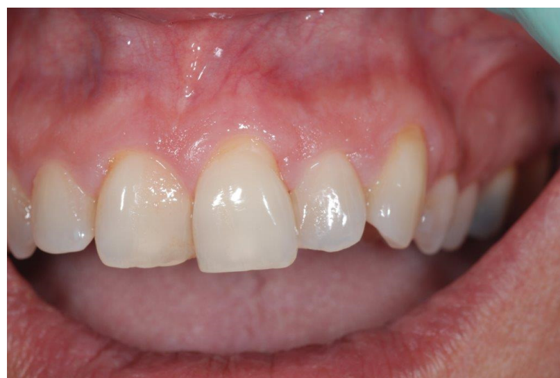
Figure 5. Complete healing after 30 days without sign of recurrence.

A wide literature review of the literature was conducted in 2009 by Kelsey et al., who collected a total of 155 cases described in detail (by gender, localization, age, race,