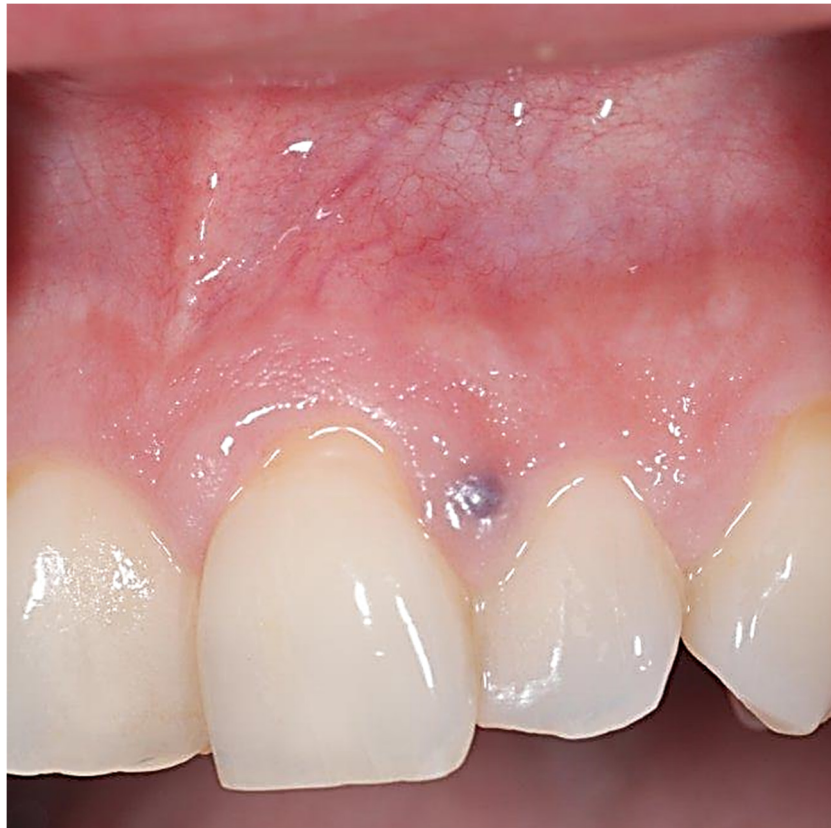
Figure 1. A bluish, solitary lesion on the interdental papilla between teeth #21 and #22.

of trauma, and the differential diagnosis included gingival swellings as fibromas or retained foreign bodies [3].