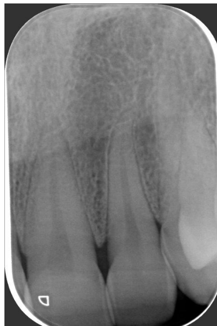
Figure 2. Periapical radiogram showing no alveolar bone involvement.