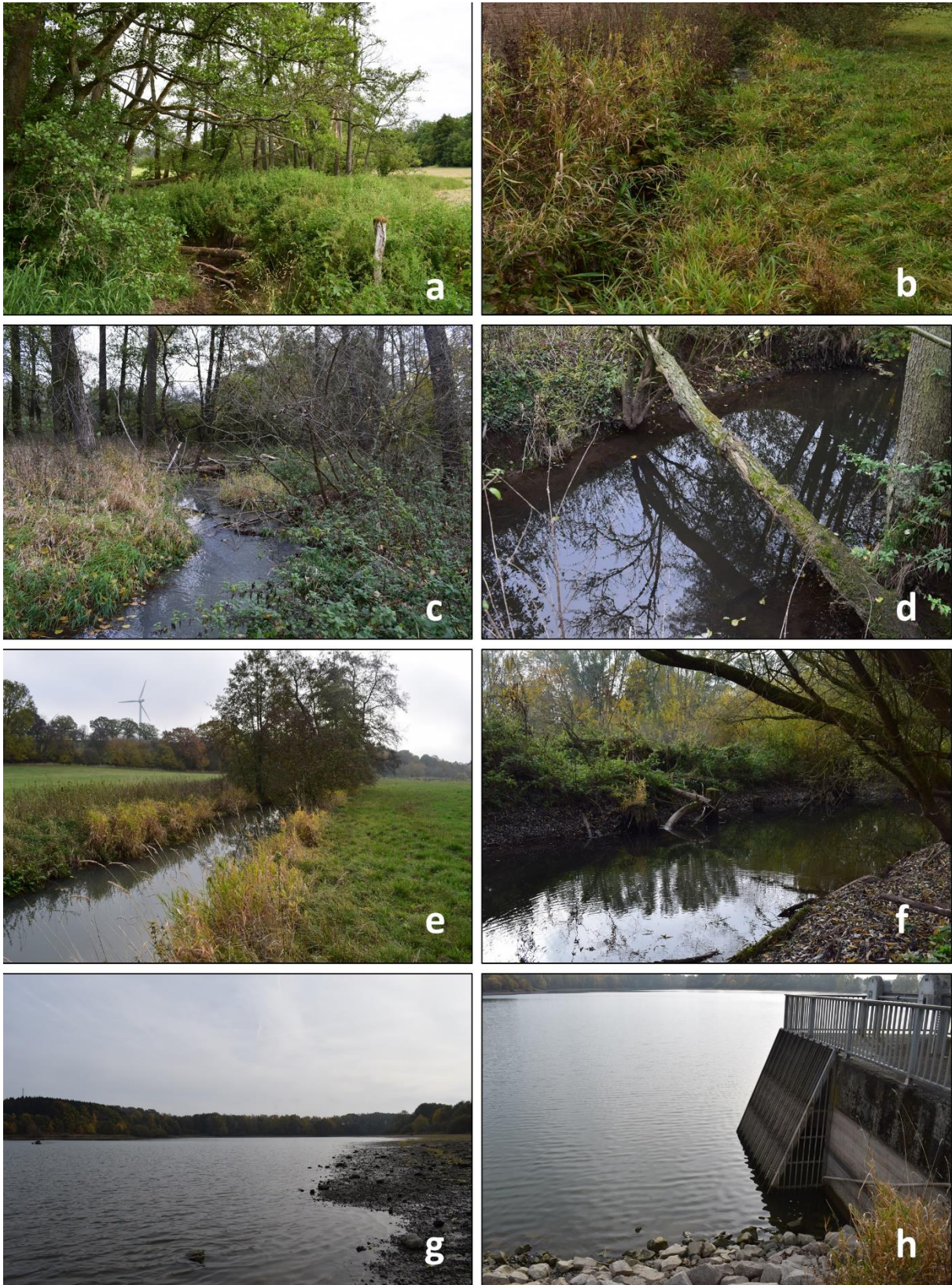
S3: Water measurement / sampling and sediment sampling stations inside the Antrift catchment area. a) GOE: Göringerbach tributary; b) OCH: Ocherbach tributary; c) AT-1: Antrift main stream upper station; d) AT-2: Antrift main stream middle station; e) AT-3: Antrift main stream lower station; f) AB-1: Antrift basin inflow area; g) AB-2: Antrift basin western bank; h) AB-3: Antrift basin dam outlet / overflow device.