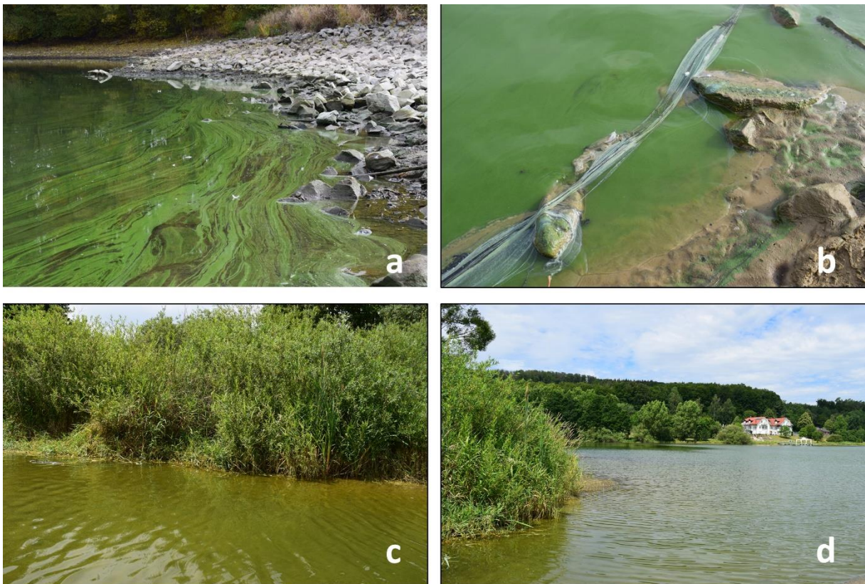
S2: Pictures of algal bloom inside the Antrift basin. a) Algal streaks at the south end of the main basin on November 5, 2018; b) Algal bloom in the western part of the main basin on 05.06.2019; c) Algal bloom on the western bank on 18.07.2019; d) View to northwest area of the antrift basin on 18.07.2019.