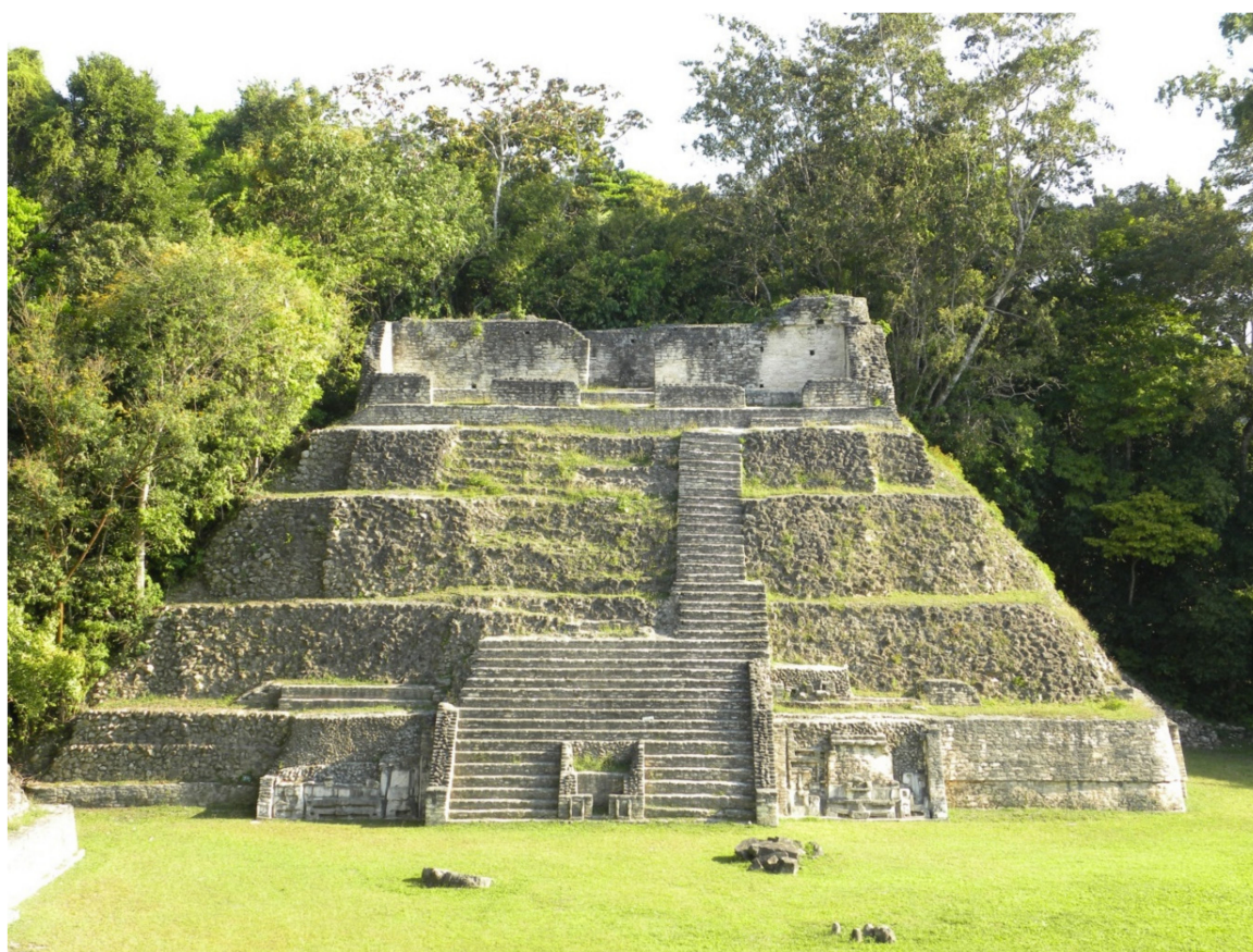
Figure 3. Caracol Structure A3 in 2011 after further stabilization by the TDP (looking north).