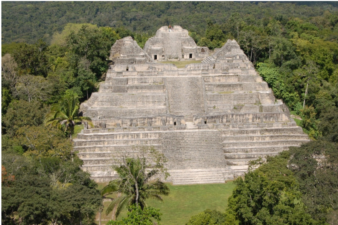
Figure 9. Caana, Caracol, Belize after stabilization by the TDP efforts.