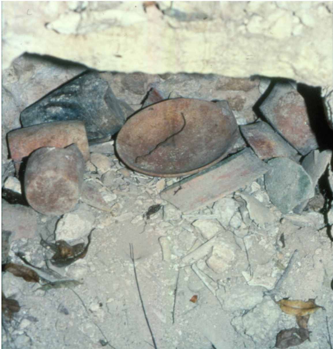
Figure 10. Artifactual materials left behind by looters at the Pajaro-Ramonal Terminus of Caracol.

Illegal excavation has continued throughout the years despite the best efforts by the Belizean military to patrol the immediate vicinity of the site. It has been accompanied over the years with an influx of people from across the Guatemalan border (only 4 km west of Caracol's epicenter) who combed through the Caracol jungle terrain in search of various items, including a wide variety of jungle resources other than archaeological materials. The first of these resources that was heavily collected was known as "shate"; the leaves of this plant were in high demand for flower arrangements throughout the developed world. The second wave of harvested items included hardwood trees. Illegal logging has been a perennial problem in the Caracol area, but in the last decade illicit loggers working at night have systematically removed entire species of trees, like mahogany and tropical cedar, for up to 10 km into Belize. They cut down the trees, carve out planks of wood with chainsaws, and then leave these planks to dry and then be hauled out by horseback at a later date across the border into Guatemala, where they are marketed. The final plant that has impacted looting and archaeological work is marijuana. Given that Guatemala and Belize have a border dispute over a 3-km wide stretch of land, many "farmers" have taken advantage of this no-person's land to plant marijuana crops