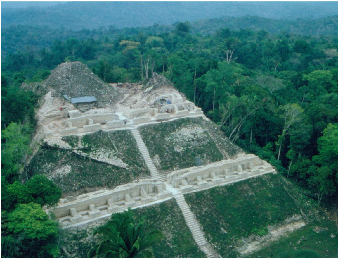
Figure 6. The USAID stabilization of the Caana architectural complex at Caracol, Belize in 1993.