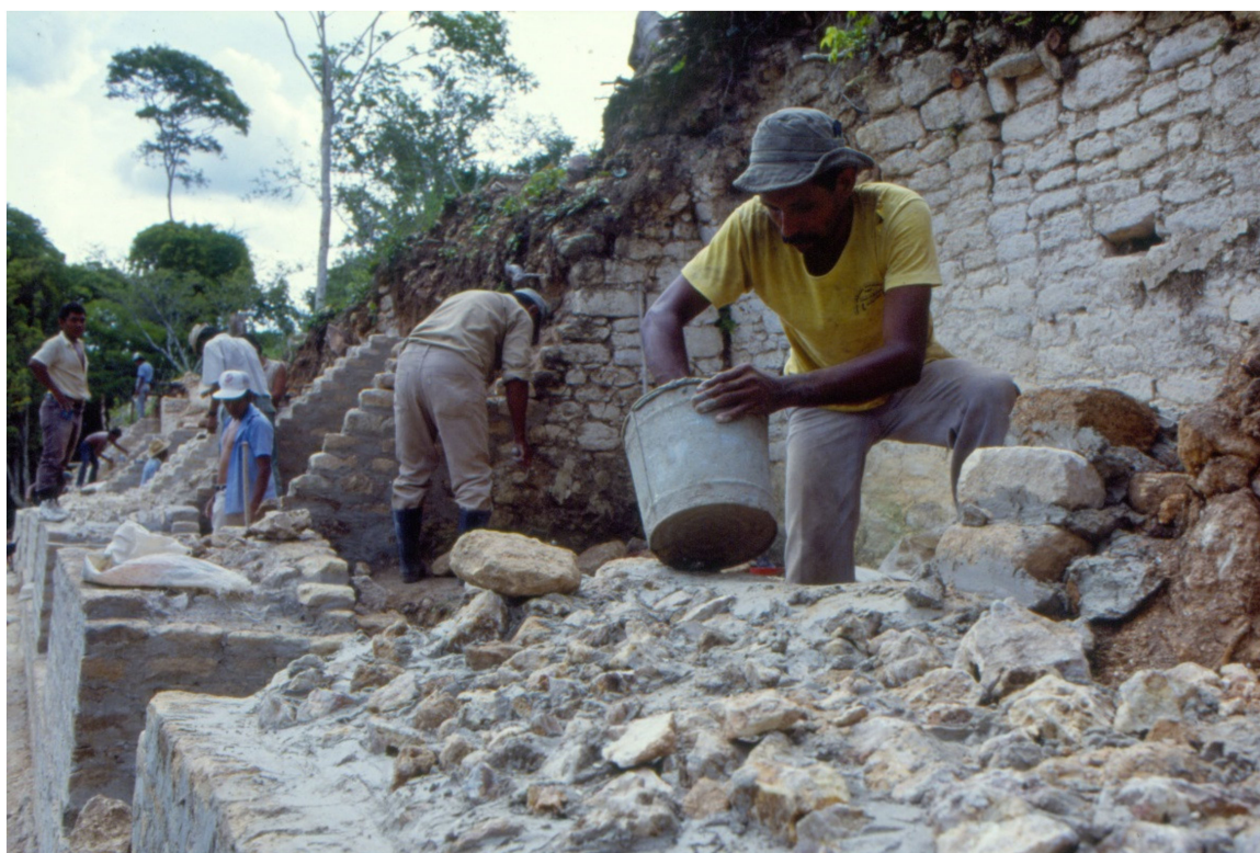
Figure 8. Stabilization being undertaken on the front face of Caana by the USAID efforts.

After the five-year USAID-Government of Belize stabilization project, the Caracol Archaeological Project continued to work closely with the Institute of Archaeology. In 1998–1999, the Institute constructed an on-site museum and visitor center just east of the site’s epicentral architecture. This small exhibition hall is accessed by all tourists and sightseers to Caracol either at the beginning or end of their site visitation. The visual panels and artifactual displays that were installed in this on-site museum were undertaken by the Caracol Archaeological Project in concert with the Belize Institute of Archaeology (the images used for the installed panels may be viewed at https://www.caracol.org/dig/virtual-museum/ ). This immediately foreshadowed Belize’s Tourism Development Project at Caracol