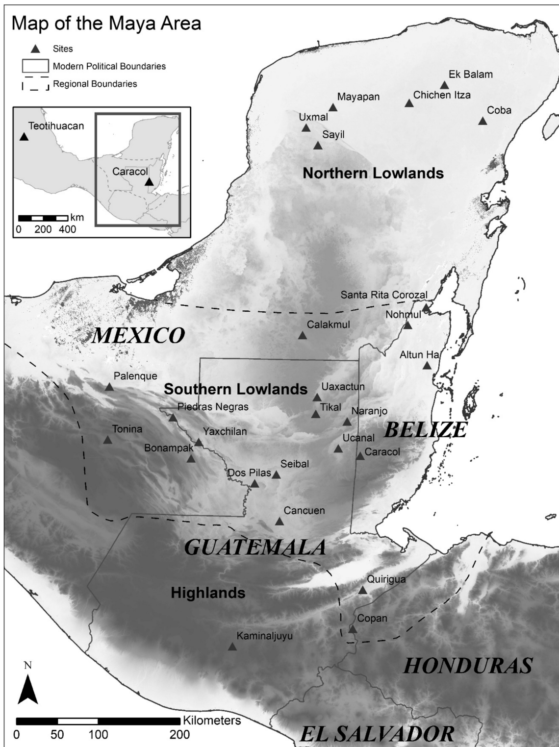
Figure 1. Map of the Maya Area with select sites in the southern lowlands indicated.

While archaeology in the Northern lowlands at Chichen Itza incorporated stabilization and preservation, Maya archaeology in the Southern lowlands did not initially have this focus. As already mentioned, at Uaxactun, later buildings were removed to expose earlier ones and to determine complete architectural plans and sequences [20] with open excavations not being backfilled [13]. Early excavations at Piedras Negras, Guatemala likewise did not focus on backfilling. The University Museum of the University of Pennsylvania carried out an archaeological project at that remote site