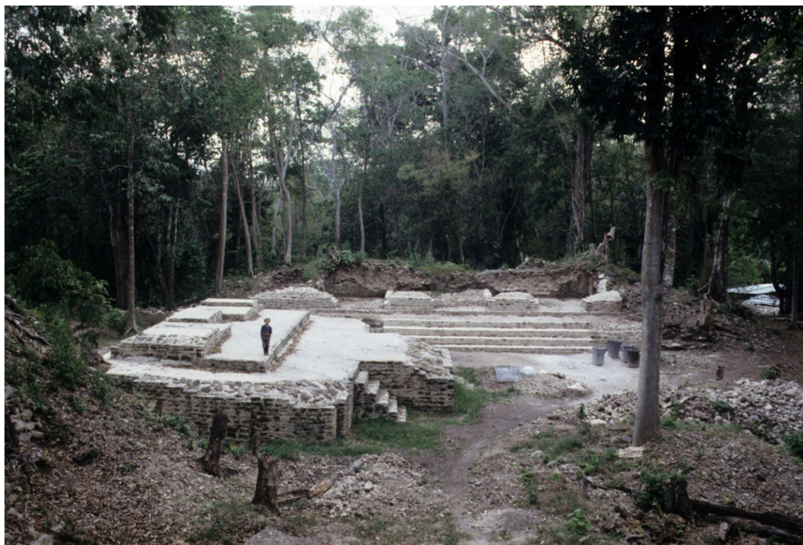
Figure 7. Caracol Central Acropolis stabilization undertaken by the USAID efforts (looking south).