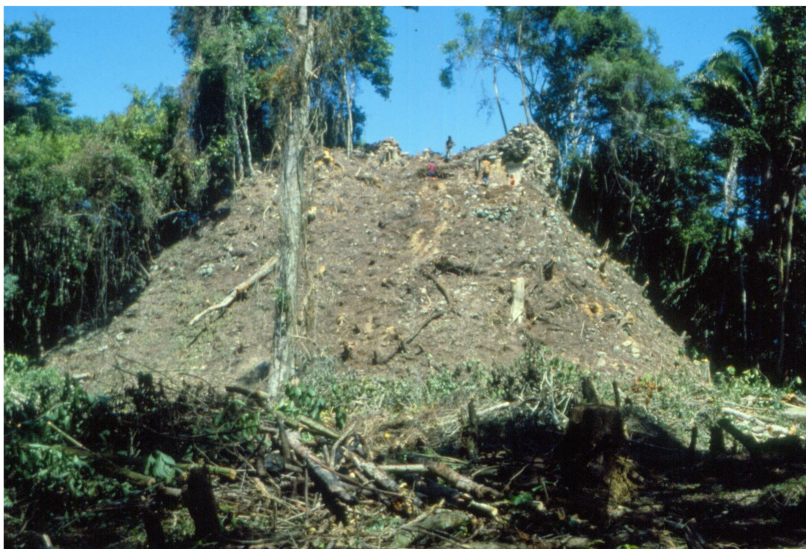
Figure 2. Caracol Structure A3 in 1986 before excavation (looking north).