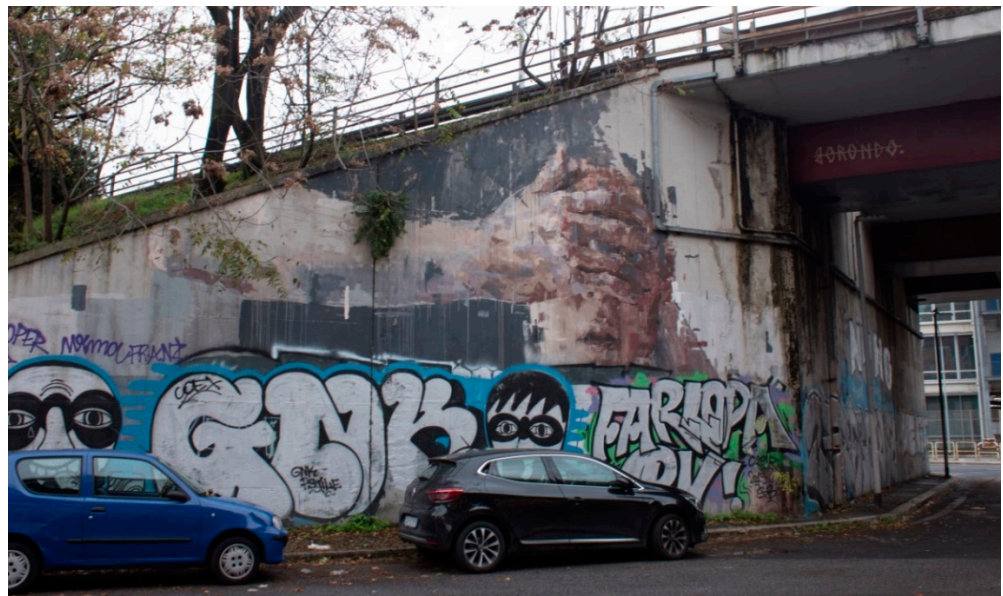
Figure 5. Borondo, street art mural realized in 2013 for “Logout project” and overlayering of vandalism writing, graffiti writing (anthropic risk); growth of biological colonization, photochemical degradation, etc.: natural risk.