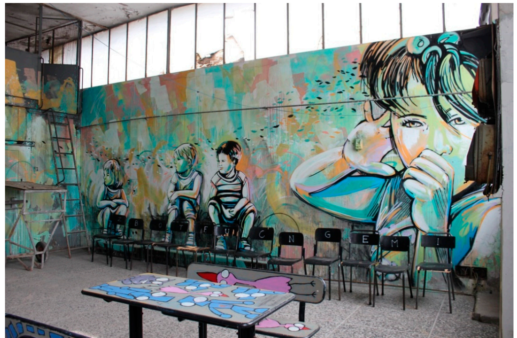
Figure 2. Alicè (Alice Pasquini) Library Toy Room (Ludoteca), MAAM—Museum of Other and Elsewhere, Rome, Italy. Indoor street mural realized and socially recognized as a work of art.

act is, indeed, already strongly rooted and developed in the citizens' consciousness and needs to also be taken in consideration by the competent authorities [14].