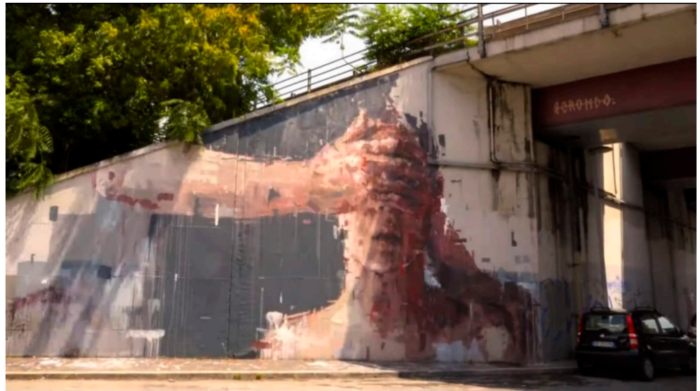
Figure 4. Borondo, street art mural realized in 2013 for “Logout project” edited by 999 contemporary gallery in collaboration with pescerosso.com with the patronage of the Municipality of Rome.