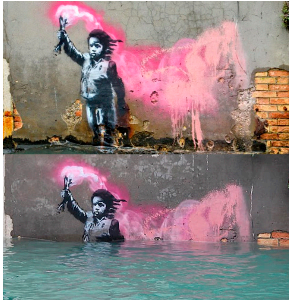
Figure 1. Migrant Child , plastic on wall, Banksy, May 2019: street art mural realized with the stencil technique on an historical wall of a venetian building.

The choice of the wall, of outdoor and large-sized art, is itself a choice of public nature where the art is clearly designed for everyone to view it. Therefore, these kinds of contemporary mural paintings are all connected to the so-called “Public Art” thanks to the specific choice of the artists in representing often important, politicized, ethical, and social messages directly in the outdoor street context, where all the people can reach them (Figure 1).