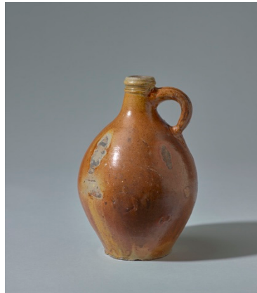
Figure 3. A stoneware jug from the wreck of The Amsterdam. Height: 28.5 cm, Width: 20 cm, Depth: 20 cm.

bottles, examples shown in Figure 4, in his site report of Bonaire's historic anchorage, many with manufacturer stamps from Weesp and Schiedam [39] (p. 39).