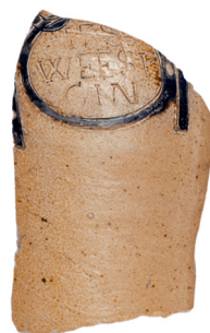
Figure 5. Fragment of a stoneware bottle with 'Weesp Gin' stamped on it. Found in Amsterdam dating to 1775–1850.

One of the bottles was stamped 'Blankenheym & Nolet', referencing Carolus Blankenheym who started distilling in Rotterdam in 1714, and a later dated bottle stamped with 'Blankenheym's Very Old Gin' [39] (p. 80). An earlier example of a stoneware genever bottle ( jeneverkruiken ) can be seen in a bottle fragment dated 1775–1850 found in Amsterdam with the words 'Weesp Gin' stamped on it as seen in Figure 5 [40]. Further examples found in Sijtwende, Netherlands, are stamped with 'Hulstkamp & Zn. & Moly Rotterdam' [41] (p. 78). While the jeneverkruiken look similar to mineral water bottles, they often had stamps indicating the distilleries and tended to be smaller. The company marked was a distillery first opened in 1775, though the bottles are from after 1823 [41].