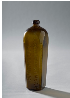
Figure 2. A glass kelderflessen from the nineteenth or twentieth century. Height: 22 cm.