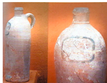
Figure 4. Jeneverkruiken from Bonaire.

One of the bottles was stamped 'Blankenheym & Nolet', referencing Carolus Blankenheym who started distilling in Rotterdam in 1714, and a later dated bottle stamped with 'Blankenheym's Very Old Gin' [39] (p. 80). An earlier example of a stoneware genever bottle ( jeneverkruiken ) can be seen in a bottle fragment dated 1775–1850 found in Amsterdam with the words 'Weesp Gin' stamped on it as seen in Figure 5 [40]. Further examples found in Sijtwende, Netherlands, are stamped with 'Hulstkamp & Zn. & Moly Rotterdam' [41] (p. 78). While the jeneverkruiken look similar to mineral water bottles, they often had stamps indicating the distilleries and tended to be smaller. The company marked was a distillery first opened in 1775, though the bottles are from after 1823 [41].