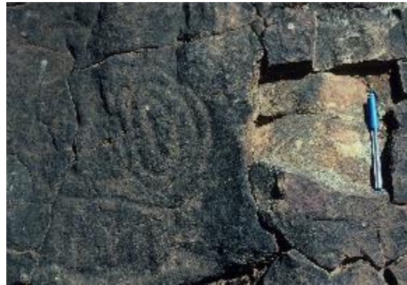
Figure 1. Light-coloured surface exposed by illegal removal of rock (right-hand side) at Mutawintji. Varnished engraved rock surface remains on left.

replaced by active management. In other situations, damage to rock art can occur through apparently indirect mechanisms such as establishing polluting industries close to rock art sites, thus leading to increased rates of rock surface weathering [30,31]. Since the World Heritage nomination of the Murajuga Cultural Landscape, the Australian government has limited future industrial approvals to one new plant [32,33] and instigated a rock art monitoring program [34,35]. The conflict between mining/industrial uses and rock art conservation has not yet arisen at Mutawintji.