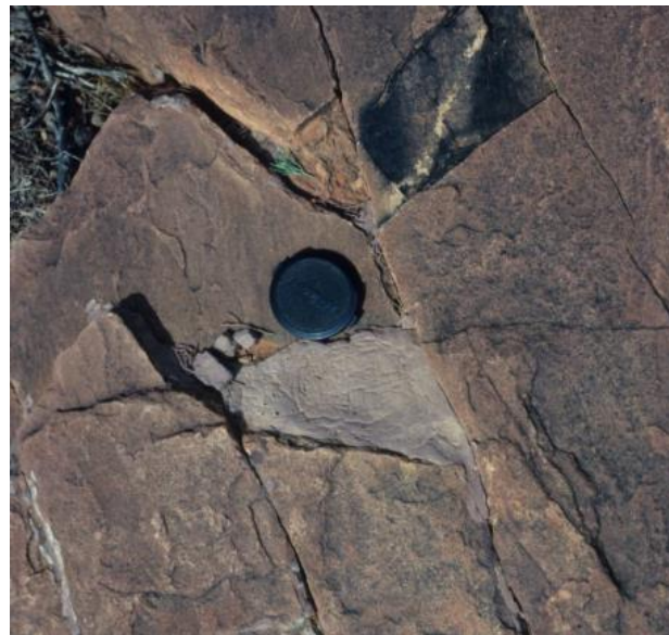
Figure 3. 'Re-attachment' of small, fractured stones (lens cap for scale) above viewing platform.