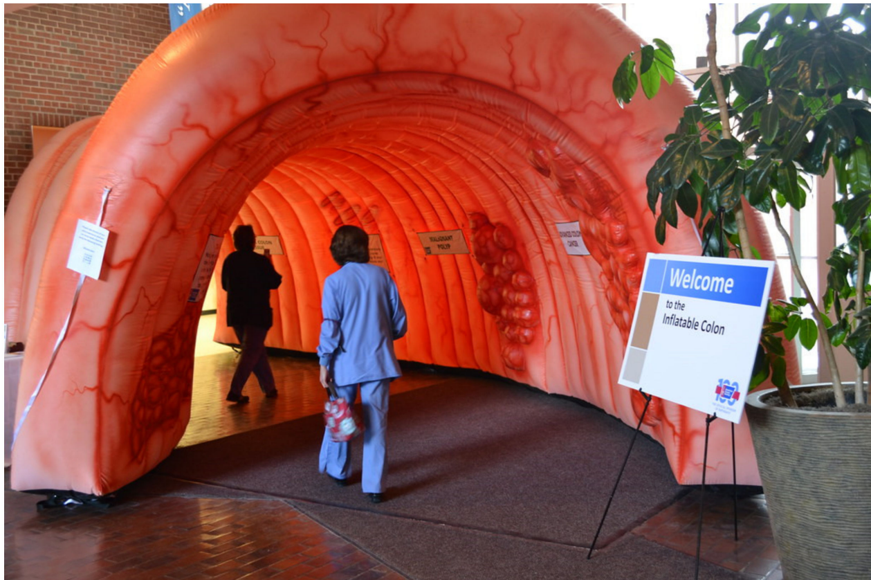
Figure 4. Giant inflatable colon on display at the Henry Ford Hospital as a part of Colorectal Cancer Awareness Month.

On the one hand, these results open a way to the new, interactive and informative tools to enhance people's awareness of CRC screening and therefore, increase their screening uptake. On the other hand, lack of time remains an important issue preventing many individuals from participating in screening programs as well as attending these outreach events. In fact, different studies have underlined that "shorter travel time" to the hospitals or health clinics definitely facilitates participation in screening programs [146,147,150].