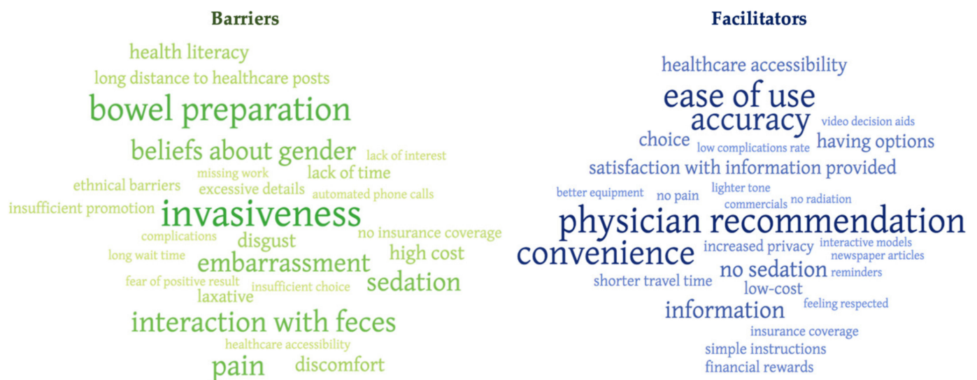
Figure 1. Word clouds (in which the size of each word indicates its frequency or importance) of the most cited barriers and facilitators to colorectal cancer screening—Created with https://worditout.com/ (accessed on 20 August 2021). Definitions: Barriers = factors that could limit or restrict participation in colorectal cancer screening; Facilitators = factors that could either promote or be perceived as the most important attributes that facilitate decision making towards participation in colorectal cancer screening.