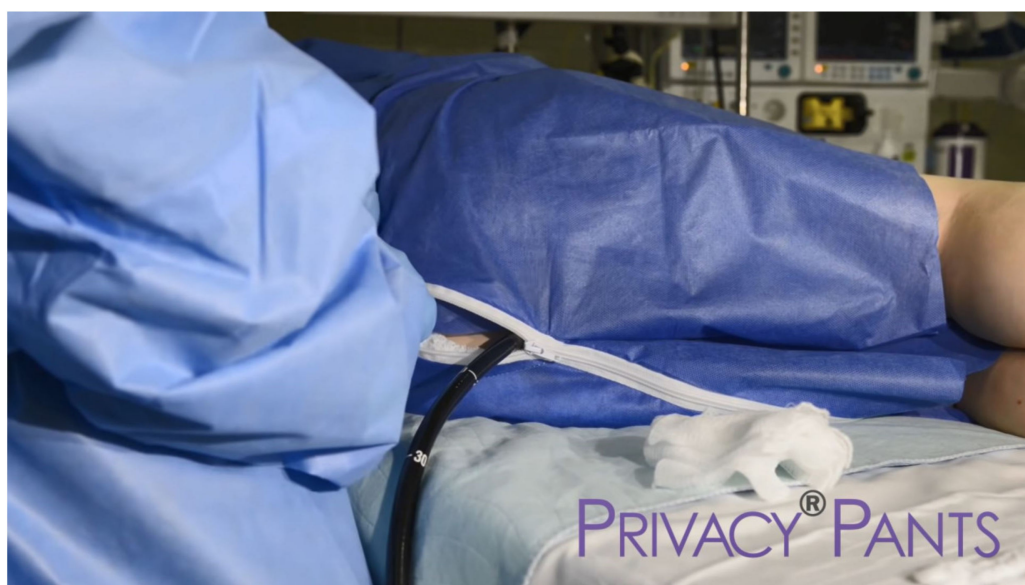
Figure 2. Illustrative image showing the utilization of the Privacy Pants ® during colonoscopy—Retrieved from Dignity Garments ( https://www.youtube.com/watch?v=tK8QplfW-ME (accessed on 1 September 2021)) [129].

Another major issue that prevents screening participation is concern for privacy. This, however, could be addressed by ensuring a protected environment and usage of adequate tools. For example, Aamar et al. [128], investigated whether the use of a novel disposable patient garment (Privacy Pants ® ; Dignity Garment, Madison, MS, USA), which increases coverage, could reduce embarrassment and increase colonoscopy acceptance. Their results were noteworthy, with increased privacy—compared to the traditional gown—reported by 76% of the participants. This tool was associated with high rates of respect and satisfaction and decreased embarrassment during the procedure. The utilization this new disposable garment is shown in Figure 2.