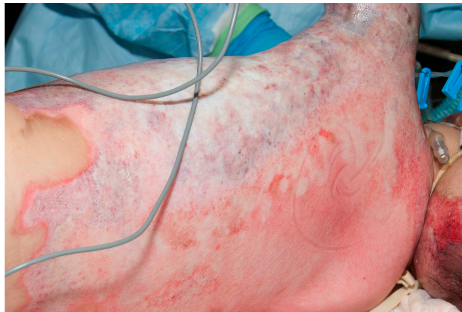
Figure 1. This child had partial thickness burns that developed the classic purple–gray appearance of invasive Pseudomonas aeruginosa . She developed profound septic shock and died the next day.

There are some specific invasive wound infections that can lead to significant problems in the burn patient. Again, their diagnoses are dependent on significant changes in the burn wound. One of the most devastating invasive infections is caused by Pseudomonas aeruginosa [49]. While Pseudomonas aeruginosa is a common colonizer of burn wounds, especially after the second week of hospitalization, coming from the digestive tract of the patient or from cross-contamination from healthcare personnel, on occasion, it can invade the wound to destroy tissue and leads to profound septic shock. Typically, Pseudomonas aeruginosa will leave a harmless yellow exudate in the wound. When Pseudomonas aeruginosa invades, the wound often develops a purple to gray color; superficial burns, or even split-thickness donor sites, become full thickness (Figure 1).