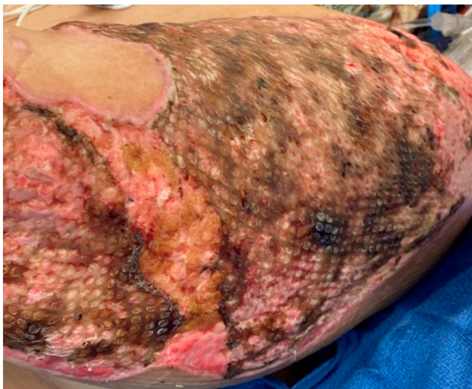
Figure 2. This wound has the whitish-brown color of Aspergillus in the recently grafted burn. The mold developed under the graft and eventually there was complete loss of the autograft.

Infections from Candida species are not very common in the burn wound, but they can occur and tend to act more like the bacterial infections [51]. They may be selected by antimicrobials that do not cover yeast, such as bacitracin or mafenide acetate. On occasion, the topical use of nystatin or miconazole is needed. Invasive fungal infections, often with filamentous fungi, while less common than bacterial infections, do occur in patients with large burns [51–54]. In some cases, a small section of nonviable fat (such as in the interstice of a widely meshed autograft) will develop a soft white exudate that looks like cottage cheese. The most common fungus is Aspergillus , but Mucorales species or Fusarium may also invade the wound. It is not uncommon for the fungi to spread and destroy the surrounding grafts (Figures 2 and 3).