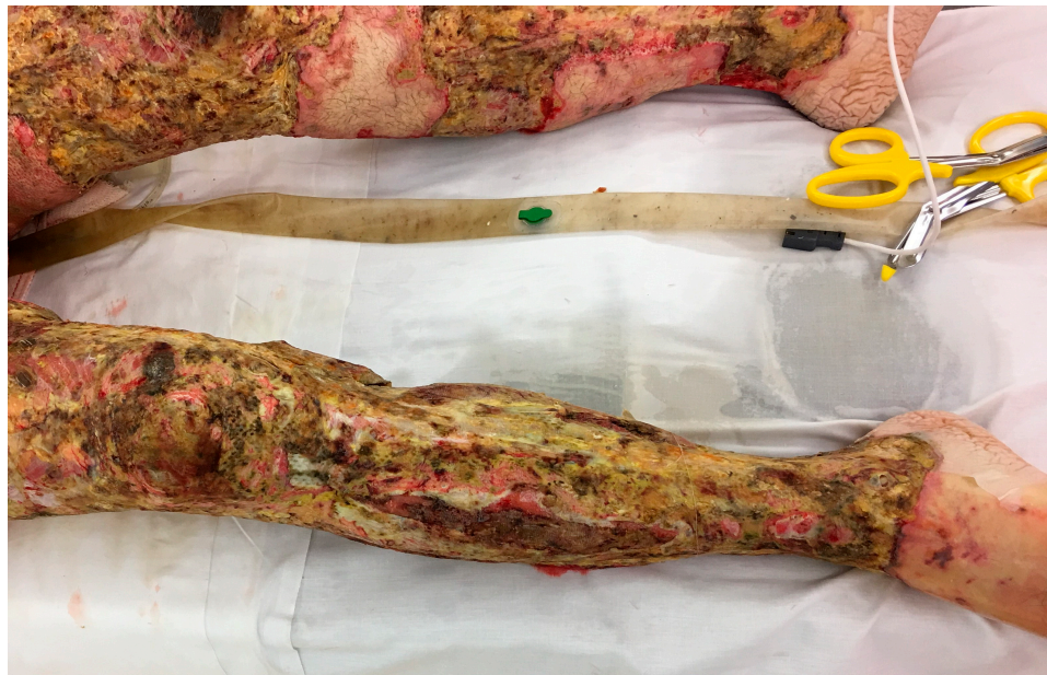
Figure 3. This man developed invasive Fusarium infection throughout his grafted burns. Despite multiple excisions, the mold continued to return, and he died.