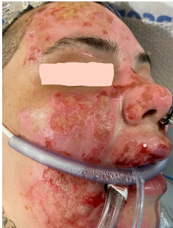
Figure 4. This patient has the classic “punched-out” lesions of Herpes simplex 1 infection in the previously healed second degree burns of the face. The wounds healed after treatment with systemic acyclovir.