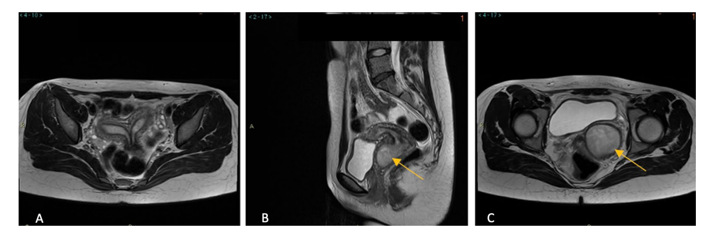
Figure 1. MRI images ( A ), axial T2 weighted image of didelphis uterus. ( B ) sagittal section of the T2-weighted MRI scan demonstrating didelphys uterus with left hemiuterus and hematocervix. ( C ), Axial T2 weighted image of the dilated left hemivagina and the presence of hematocervix (arrow).