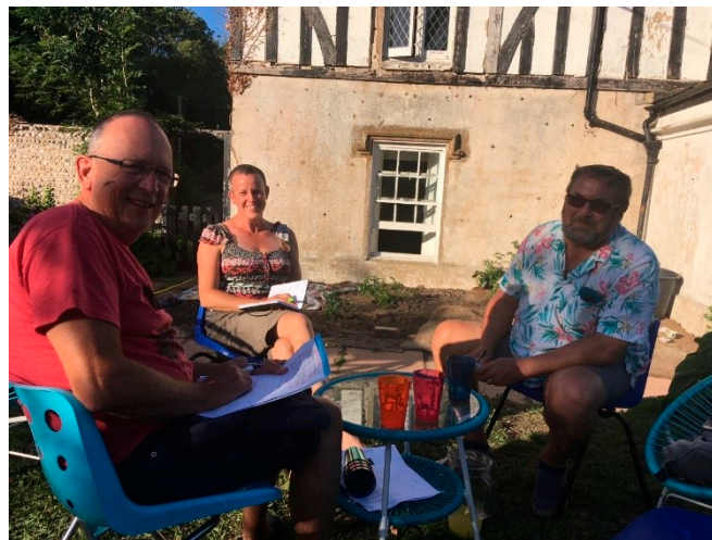
Figure 2. First education group meeting at Langney Priory, 15 July 2019 @ P von Hellermann.

Over the next few months, both the Eco Action Network and the Carbon Neutral 2030 campaign were consolidated and formally launched. On 9 November, we held the official EAN launch meeting, in the conference room of the Town Hall. With over 60 people in attendance, I laid out our overall vision of the EAN, and how we would work together with Eastbourne Borough Council towards our Carbon Neutral 2030 goal through focused working groups (Figures 3 and 4).