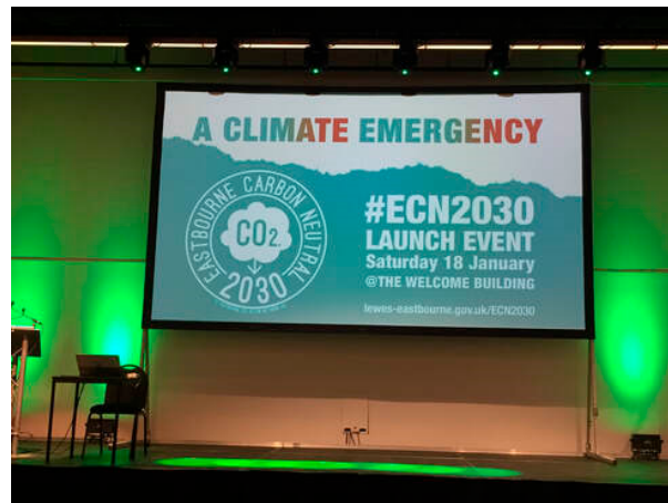
Figure 5. Carbo Neutral 2030 Launch event, Welcome Building, Eastbourne, 18 January 2020 @UNA Eastbourne.