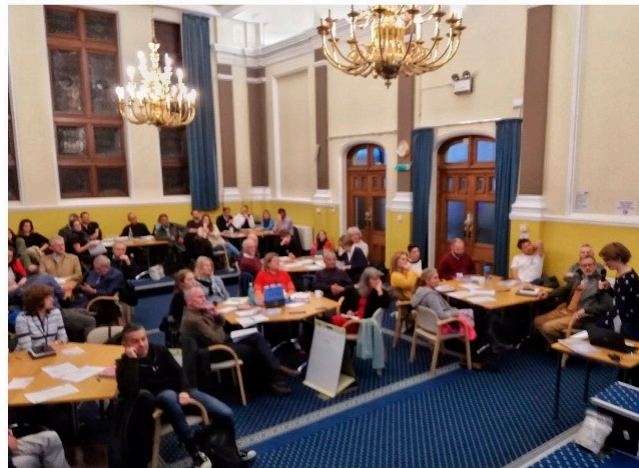
Figure 4. Author on right giving talk at EAN inaugural meeting, 9 November 2019

For the rest of the meeting, people broke up into smaller group discussions, so that each working group could start initial conversations, create a contact list and communication forum, and gather ideas. This, too, was a positive, constructive meeting, in which we felt we had set up the basic structures for feasible, inclusive, egalitarian and flexible council-citizen collaboration. Over the following weeks, the working groups started meeting and working together, whilst the EAN directors focused on creating a website and Trello platform and on working with Eastbourne Borough Council, which was developing its own strategies and creating the Sustainability Officer position.