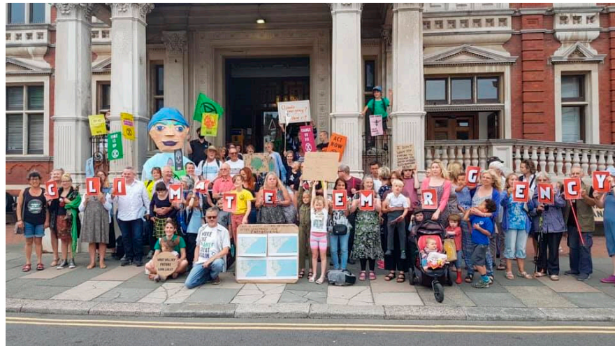
Figure 1. Protest outside Eastbourne Town Hall for Climate Emergency, 10 July 2019

the Eco Action Network (EAN). This network would register as a Community Interest Company (CIC), with activists as directors, so that we could raise funds. Moreover, we decided to form focused working groups, each bringing together Councillors, citizens and 'specialist' (professionals, long-standing experts and those working in existing relevant NGOs or pressure groups). Because I had already for some months been trying to set up a local eco-school network through my small Parents for Future group, we decided that I would lead the education group (Figure 2).