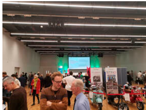
Figure 6. Stalls and visitors at Carbon Neutral 2030 Launch event, 18 January 2020 @UNA Eastbourne.

Again, there was much positive energy, and after the event many more people signed up to join EAN. EBC and EAN collaboration, meanwhile, continued in now routinized and established forms, with both individual Councillors participating in working groups and the EBC Climate Change Strategy Group, which included EAN directors, meeting regularly. Most importantly, the newly appointed Sustainability Officer worked with this committee on putting together an ‘ECN2030 Eastbourne Borough Council Climate Emergency Strategy’, laying out an action plan [8] for reaching carbon neutrality by 2030. As one of the EAN’s core architects, at this point I was proud and excited that we had developed our own, unique form of council-citizen collaboration—in a socially and politically conservative small seaside town, too—and genuinely excited about the potential of the structures we had put in place.