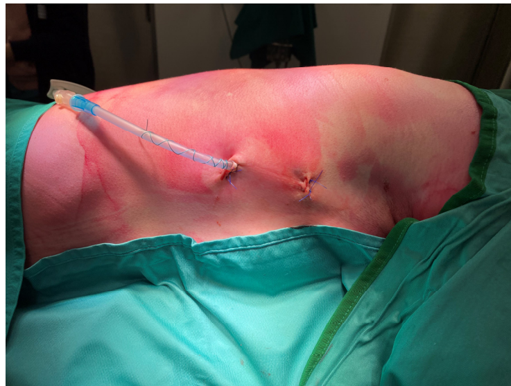
Figure 1. Post-operative picture showing surgical ports after chest tube placement.