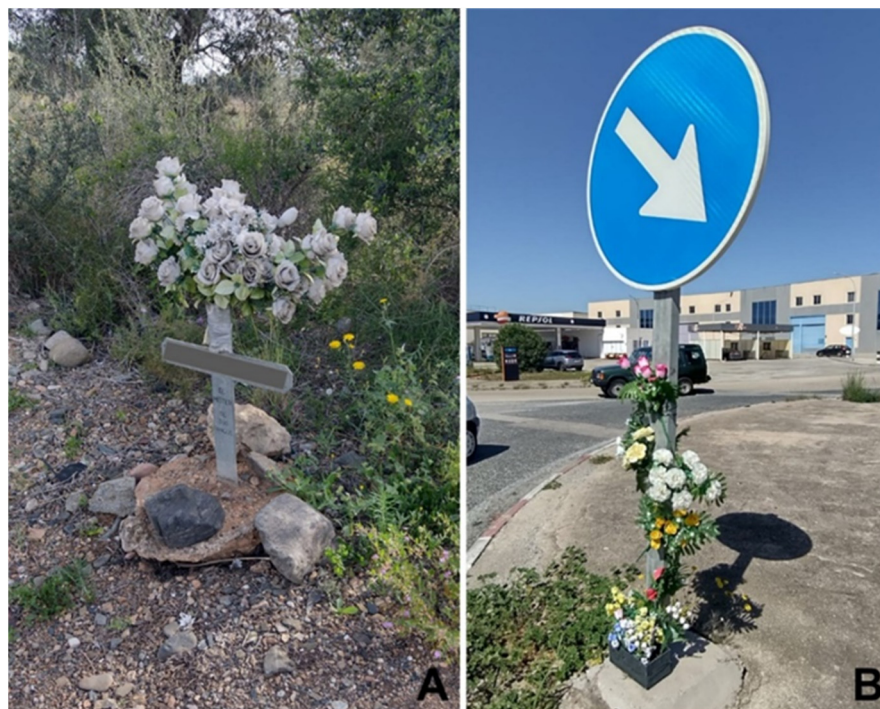
Figure 2. Two examples of roadside shrines (devoted to vehicle-related deaths) in Spain. (A) Shrine on the C-14 road (Reus, Tarragona Province, Spain) with the name of the dead blurred; (B) shrine on the N-340 road (Bellvei, Tarragona Province, Spain). The latter road is one of the most dangerous of Spain and regrettably saw probably the deadliest accident in the history of road transportation (the ‘Alfacs accident’, with >200 deaths).

March 2024) and a Ramsar site ( https://rsis.ramsar.org/ris/1677?language=en ; accessed on 30 March 2024). Alien species surrounding protected areas (PAs) are a risk to the native biodiversity that cannot be dismissed; in a recent study, the alien species were recorded in PAs, on average, just 4.5 years after being recorded in the 0–5 km surrounding belts [25].