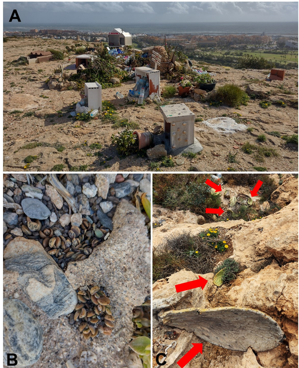
Figure 1. General view of the ‘Difunta Correa’ roadside shrine: (A) in Almería, south-eastern Spain; (B) plantlets of Kalanchoe × houghtonii established in nearby rock cracks; (C) dispersal of Opuntia ficus-indica cladodes down the cliff.

legend of the ‘Difunta Correa’ (the ‘Deceased Correa’ in English) came from the story of a woman (Deolinda Correa) who died in the desert following the tracks of her captured military husband around 1830–1840, but her newborn baby survived thanks to her endless breast milk, even after death [8]. To calm the thirst of Deolinda Correa, devotees offer her water, so shrines devoted to the ‘Difunta Correa’ are almost invariably surrounded by many plastic bottles [9]. Probably linked to the growing community of migrants from Argentina in Spain, the shrine harbored its first buildings in 2010 [10], and it is probably the only of its kind outside South America. It is estimated that this folk belief has up to seven million followers across the world [11].