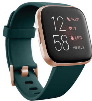
Figure 1. Image of Fitbit Versa 2 device [16].

As mentioned, the data comprised 60 days' worth of data from a type 1 diabetic individual acquired across the summer period. The glucose level distribution spanned 4–10 mmol/L, classification exercise involved the prediction of glucose level into two discrete bands comprising 'Excellent', with an associated glucose level measure in the range of 4–7 mmol/L; and 'Good', with an associated glucose level measure in the range of 7–10 mmol/L. It should be noted that further classes could not be created due to the effective management of glucose level within a tight band by the diabetic individual. The glucose readings were monitored by the Fitbit device, where 120 samples of the glucose levels were recorded daily, therein providing a glucose sample rate of 120/day. These 120 glucose readings were averaged out to produce a corresponding glucose level reading per day, which in turn contributes towards uncertainty reduction through lessening the effect of device drift from the readings provided by the device, as per ergodic theory. The inputs used to form a feature vector in this study correspond to solely physical activity features as reported by the Fitbit and can be seen in Table 1. These features are specific activity attributes which reflect an individual's overall activity level, which can be said to influence a person's glucose levels.