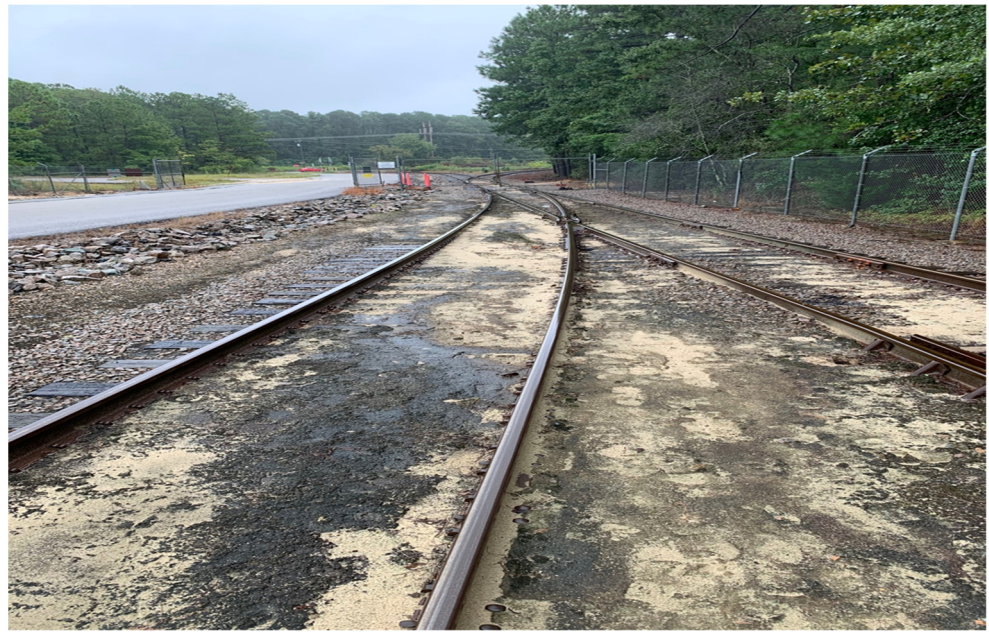
Figure 1. Fouled Ballast located at an Army Installation.