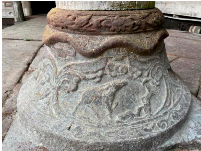
Figure 4. Carvings on the stone pillars of the Han Family Compound.