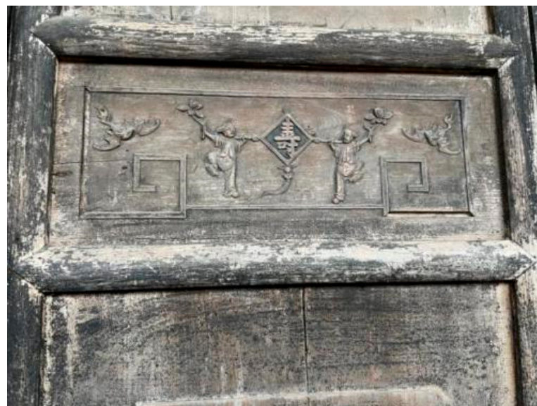
Figure 3. Carvings on the doors and windows of the Han Family Compound.

It is worth noting that in the courtyard, the doors, windows, and stone columns all depict skillful carvings, openwork, reliefs, and inlaid carvings. The themes style mostly include auspicious beasts, birds, flowers, and patterns; traditional Chinese cultural stories include the Peach Garden, the Eight Immortals across the sea, and the Three Heroes battle Lv Bu. (Figures 3 and 4).