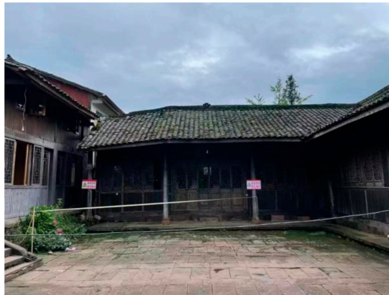
Figure 1. Collapsed portion of compound No. 1 of the Han Family Compound.

the Han family compound, and the parameter information was gradually used to build a preliminary three-dimensional model.