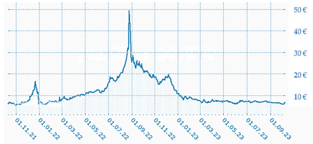
Figure 1. Electricity price development. Adapted with permission from Ref [7]. 2023, oEnergetice.cz.

In recent years, the Slovakian car market has had many ups and downs. At the start of the decade, demand for car passengers fluctuated between 71,000 and 75,000. Then, 2014 saw the beginning of a 6-year upward trend that would lead total car sales up to the current all-time high in 2019 at 109,978. In 2020, the pandemic caused many markets in Europe to collapse, and the Slovakian one was no different, falling 25.4% down to 2014 sales. The following year, demand bounced back, inverting the trend and bringing sales to 84,084 (+2.5%). Despite rising another 4.2% in 2022, these past two years have not been enough to offset the major fall in 2020. Slovakia Auto Sales in August 2023 grew for the 10th month in a row, posting 7487 new car sales (+11.8%). The YTD figures at 60,943 are up 15.3% from the previous year [8].