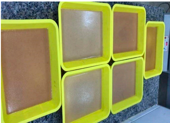
Figure S1. Filmogenic solution deposited in trays after gelatinization for drying in an oven.

FF: Fiberless Film, SFF: Sugarcane Fiber Film.