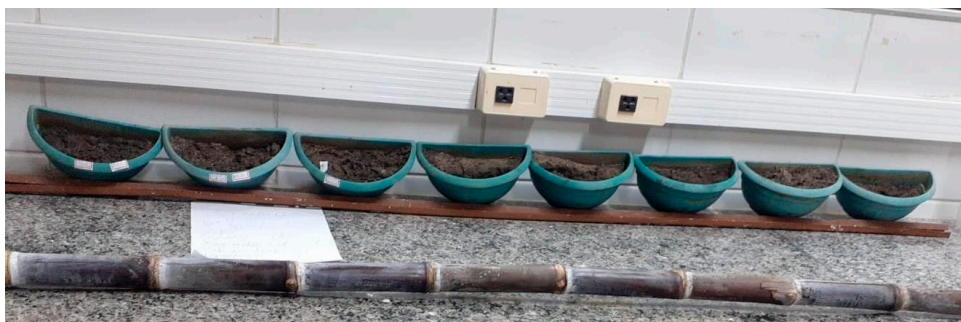
Figure S4. Biodegradability test of soil films.