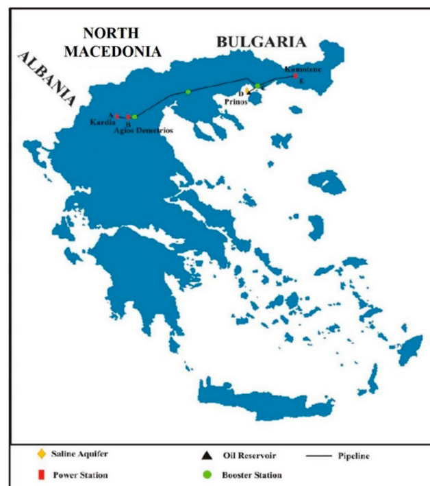
Figure 2. Transportation routes from the power plants to Prinos. Adapted with permission from Ref. [4]. 2009, Nikolaos Koukouzas, Ioannis Typou.

Figure 2 indicates the exact route of the pipelines that will be used for the transportation of carbon dioxide. Also, the three boost stations that will be installed near Ptolemaida, Lagadas of Thessaloniki, and next to Energean’s onshore facilities in the city of Kavala are presented. The operation of push stations lies in the need to eliminate the reduction in pressure due to the distance that the product must travel to be stored.