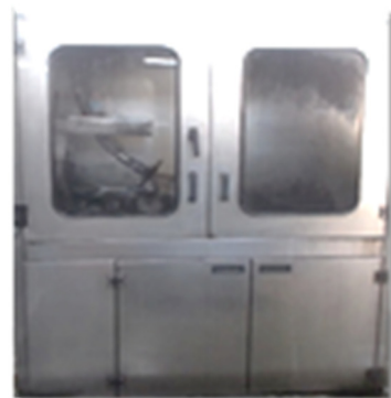
Figure 4. Diesel filters regeneration compact machine.

The scope of this study is to evaluate the developed method of MONOLITHOS Ltd. for regenerating diesel filters using the novel solution on an industrial scale. The catalytic systems are placed in regeneration machine (Figure 4) without being dismantled.