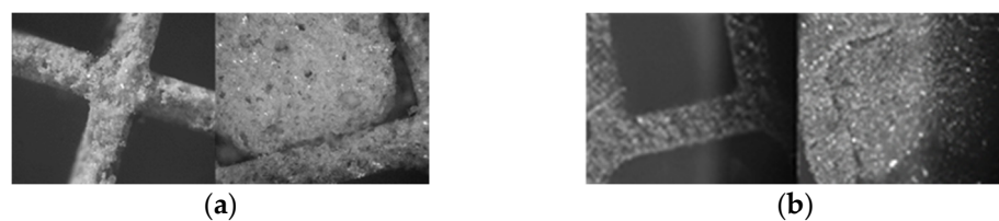
Figure 1. Optical microscopy images of the inner and external piece of (a) c-DPF (b) DPF.

According to microscope images collected at c-DPF's internal and external part (Figure 1a), the cells' walls and blocked channels are described in detail. The width of the wall was measured approximately 0.4547 mm.