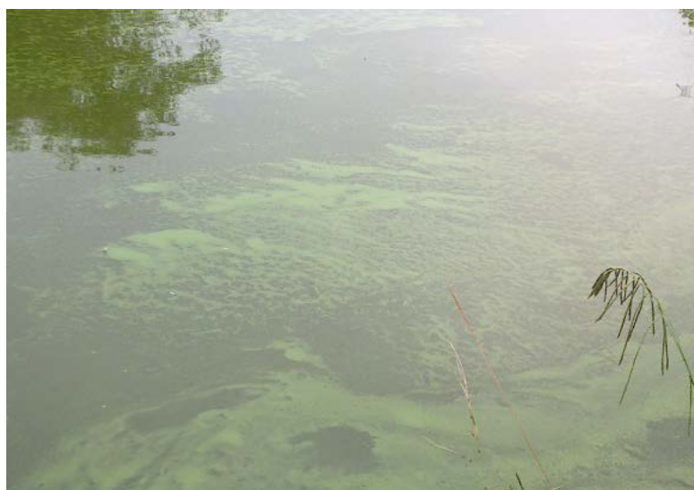
Figure 1. Photograph of a CyanoBloom ( Microcystis sp.) in a river in the North of Portugal.