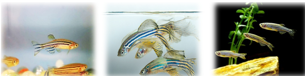
Figure 2. Adult zebrafish illustration.

The zebrafish was described in 1882 by Francis Hamilton, who found it near the Ganges River in India [19]. After George Streisinger first used the zebrafish to study vertebrate development in the 1980s, it became one of the most important laboratory animals with unprecedented speed [8]. The zebrafish is native to most of the Indian subcontinent, from Pakistan in the west through India, Nepal, and Bangladesh to Myanmar in the east. Zebrafish can be found in a wide variety of habitats. The adult zebrafish is 2 to 4 cm long, and its body is characterized by zebra-like stripes (Figure 2).