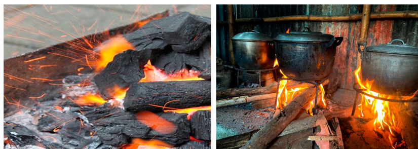
Figure 1. Representative figures for biomass combustion in Mozambique.

ramifications since the impacts of seemingly minor illnesses, such as air pollution as it is illustrated in the Figure 1, can compound pre-existing health problems. Investigating air pollution concerns in developing nations is critical since assumptions based purely on data from other populations may need to adequately reflect these places' specific context and vulnerability [2–5].