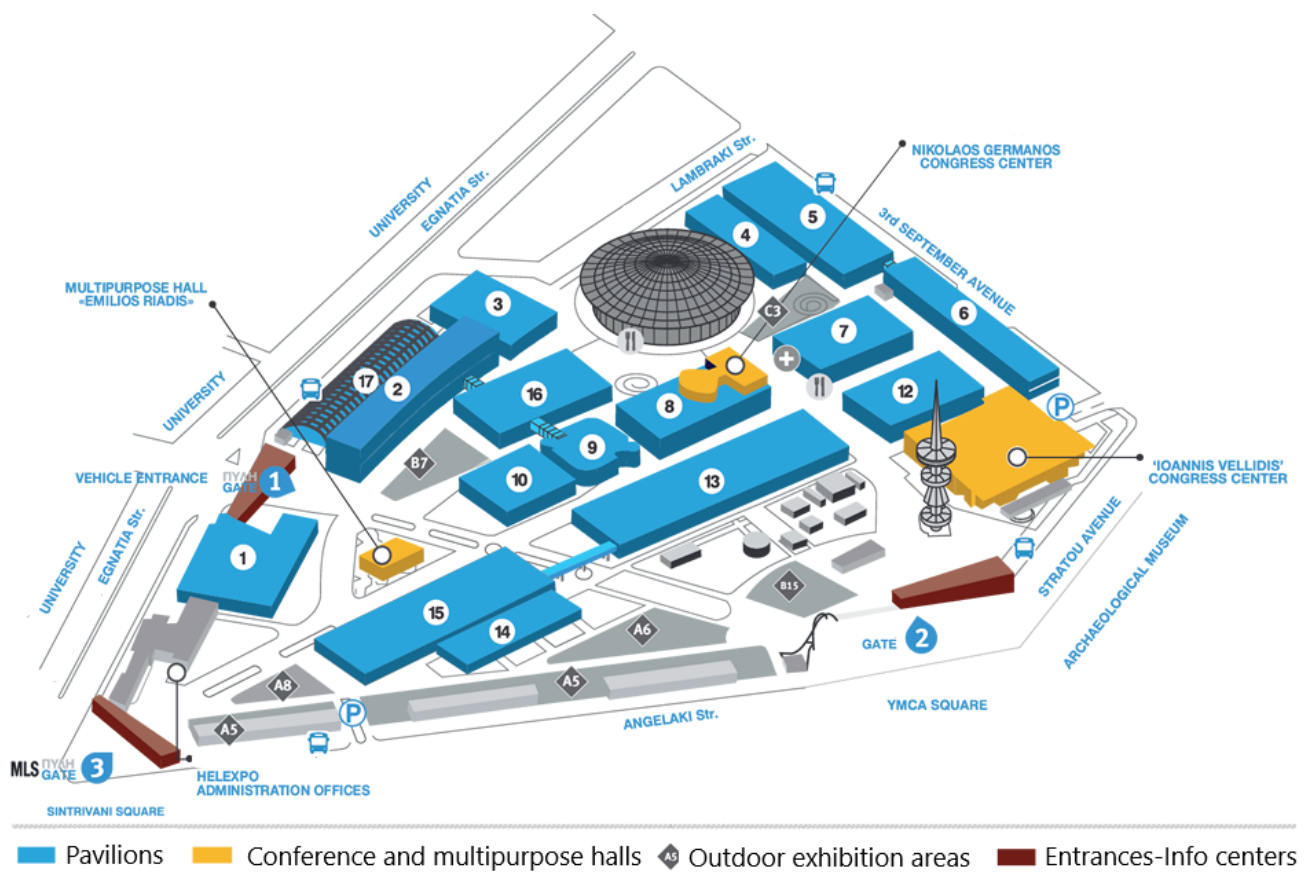
Figure 2. TIF-HELEXPO floor plan (source: TIF-HELEXPO: https://www.helexpo.gr , accessed on 11 April 2024).

Regarding the sampling of our research, quota sampling was used, that is, selecting a sample based on some known characteristic of the population [47]. Specifically, two interviewees were selected from each pavilion of the trade fairs (see floor plan in Figure 2 and the pavilions in Table 1). It should be noted here that different categories of exhibits are grouped in each pavilion; therefore, there are different characteristics of the research population in each of them.