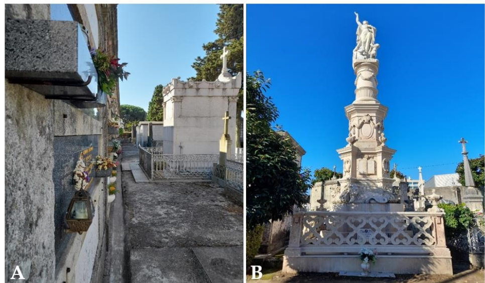
Figure 1. Graves and chapel vaults at the Cemetery of Monte d’Arcos, Braga, Portugal (A). Example of an ornamented vault at the same cemetery (B). Photographs taken in September 2021.

In a Catholic setting, between the eighth and the eighteenth centuries, burials would occur inside and around the walls of local churches so that the human soul could benefit from their sacred environment [7–11]. The concern about the unhygienic nature of traditional entombment began in 1706 with the Italian anatomist, epidemiologist, and physician Giovanni Maria Lancisi (1654–1720) advising Pope Clement XI to build four cemeteries outside the urban area of Rome [12]. The former line of argument led to the prohibition of burials in churches in distinct European countries such as France (1776), Sweden (1783), and Spain (1785–1787) [12]. Nevertheless, it was only with the opening of the Parisian Père-Lachaise Cemetery (1804) under Napoleonic influence that a substantial change took place [13]. The so-called “new cemeteries” would be a mixture of fauna, flora, and monumental sculptures, setting a place to worship the dead outside the limits of the city (Figure 1). Public cemeteries of such kind would arouse emotional reactions and incorporate the bucolic characteristics of the artistic Romantic movement, hosting individuals of all religions. The idea soon spread around Europe, including to Portugal.