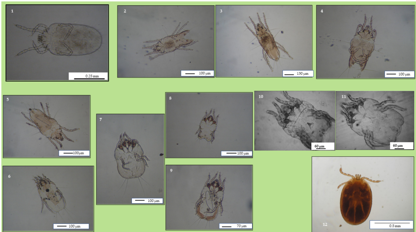
Figure 2. Mite (1–11) and tick (12) species identified in raptors in Tuscany, central Italy. 1. Neotrombicula autumnalis larva; 2. Hieracolicthus sp. male; 3. Hieracolicthus sp. female; 4. Hieracolicthus nisi male; 5. H. nisi female; 6. Glaucalges attenuatus female; 7. Kramerella lunulata female; 8. Kramerella lyra male; 9. K. lyra female; 10. Kramerella sp. male; 11. Kramerella sp. female; 12. Haemaphysalis sp. larva.

( P. apivorus ) were found to be positive for both chewing lice and mites; more specifically N. clayae or C. apivorus (Table 1; Figure 1: 5, 7) and H. nisi (Table 1; Figure 2(4,5)) were concurrently found in these two honey buzzards.