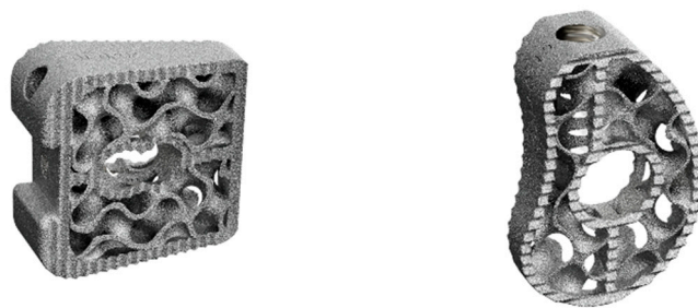
Figure 1. Example of metallic midfoot wedges: Evans osteotomy (left) and Cotton osteotomy (right).

well-reported throughout the literature [1,2]. While foot and ankle surgeons are generally in agreement regarding the efficacy of osteotomy-type procedures for PCFD, the choice of wedge material has yet to become universal. With materials ranging from structural autograft, allograft, xenograft, and synthetic substances, the benefits of each material remain reliant on surgeon preference and availability [3]. Moreover, porous titanium, a recent technology which has been utilized extensively within knee and hip arthroplasty [4,5], has recently begun increasing in popularity within foot and ankle orthopedics as a midfoot wedge manufacturing material (Figure 1) [6]. The utilization of metallic wedges for PCFD correction offers several advantages. First, metallic wedges possess a comparable elastic modulus to subchondral bone, enabling durable correction [6]. Second, the risk of infection is minimized as metallic wedges are inert and cannot transmit diseases [6]. Lastly, metallic wedges mitigate osseous resorption through their design, addressing a common problem associated with traditional graft options for midfoot wedges [7].