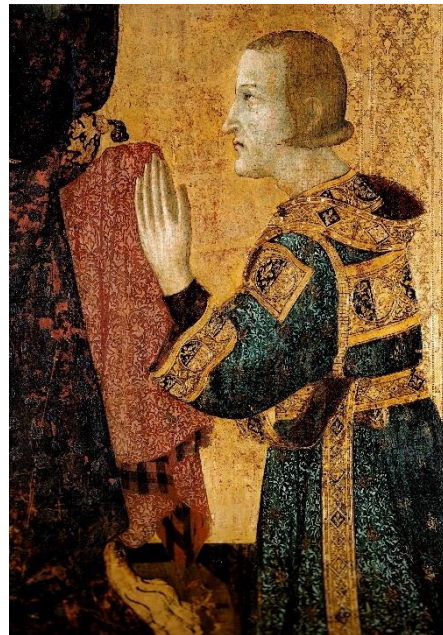
Figure 1. Simone Martini, Saint Louis of Toulouse crowning King Robert of Anjou , painting on wood, 1317–1319. Naples, Museo di Capodimonte. Detail of Robert's face.

In the second group, instead, are representations connected with religious and devotional contexts and associated, so to speak, with the private sphere and the personal practices of Robert. They represent the Angevin as a devotee (face in profile, kneeling position, small size, and proximity to religious subjects) while he carries out liturgical activities and devotional acts. What is more, they render, following the report on the bones of the King by the Istituto di Anatomia Umana Normale dell'Università di Napoli in June 1959 (see [11] (pp. 40–42)), his real physical features: light brown hair that falls straight down to the neck and concludes with a rather tight curl; shaved, thin, and oblong face; protruding and pointed chin; accentuated jaw; thin lips; pronounced nose; narrow eyes that, as well as the cheeks, are rather sunken and that highlight the cheekbones; high and spacious forehead; and deep wrinkles around the nose and mouth (Figure 1). This entry focuses on this second group of images. In particular, they are the following four artworks: Simone Martini's altarpiece, the Master of Giovanni Barrile's panel, the Master of the Franciscan tempera's canvas, and the so-called Lello da Orvieto's fresco (regarding the identification of Robert of Anjou's official image, see [12] (pp. 97–110), with more information and bibliographic references).