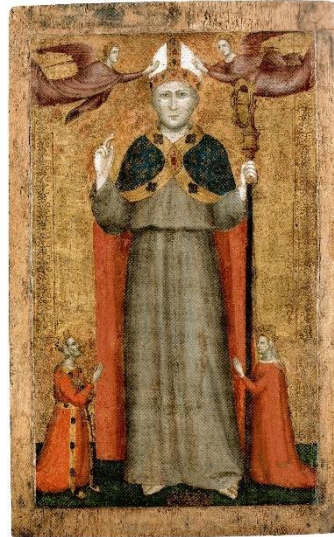
Figure 3. Master of Giovanni Barrile, Saint Louis of Toulouse worshipped by Robert of Anjou and Sancia of Majorca , painting on wooden panel, 1330–1336. Aix-en-Provence, Musée Granet. Image published in [12] (Figure 11).

prayers of the friars of the convent towards the Saint in favour of the royal couple. In this sense, the panel played a role in the religious and liturgical activities of the church (for more details and bibliographic references about this interpretation, see [12] (pp. 130–136)).