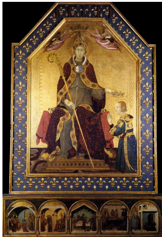
Figure 2. Simone Martini, Saint Louis of Toulouse crowning King Robert of Anjou , painting on wood, 1317–1319. Naples, Museo di Capodimonte.

two angels are crowning him and, in turn, he is crowning his younger brother. Robert is devoutly kneeling at his feet and he wears ceremonial robes and a sort of pallium, both richly decorated and embroidered with the coats of arms of Anjou and Jerusalem. If the face of Louis, in the frontal position, is rather stereotyped, the face of Robert, in profile position, is considered one of the first examples of a portrait in medieval art and, as said, it follows the real appearance of the King. Precious gems and goldsmith works directly embedded in the wooden panel decorate the whole composition. In the underlying predella, there are five episodes of Louis' life taken from the texts of his canonisation process. From left to right, they are as follows: the election as bishop by Pope Boniface VIII; the taking of the Franciscan habit and the consequent acceptance of the bishopric of Toulouse; Louis in the act of serving at the table; Louis' death; and his post-mortem miracle (regarding the scenes in the predella, see [19]).