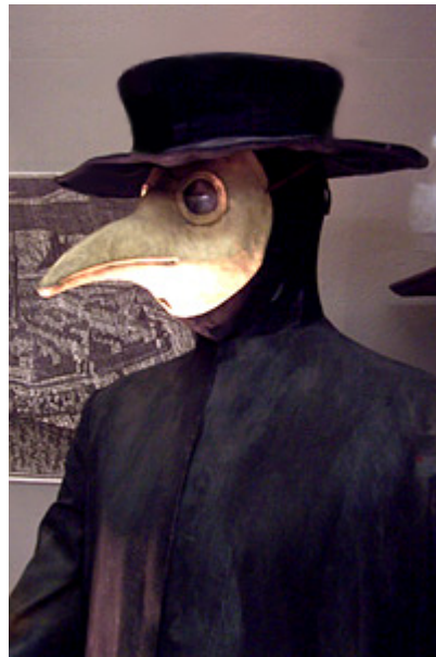
Figure 1. Special physician clothes for preventing pestilence (Germany, XVII century) at Jena. Juan Antonio Ruiz Rivas-Enciclopedia Libre en Español.

person to person via a droplet infection through airway secretions discharged from a patient with pneumonic plague. Accordingly, masks worn by doctors during this plague were categorized as medical masks. In Japan, medical masks became widely used after the Spanish flu (commonly known as the H1N1 subtype of influenza that spread worldwide from 1918 to 1920). Thus, masks have historically been used for infection prevention.