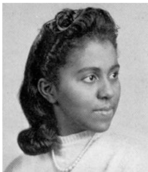
Figure 11. Marie Daly.

The fact that World War II produced a great labor shortage in the country and that, on the other hand, scientists were needed to help with the problems arising from that war, was taken advantage of by Marie Daly (in Figure 11), as well as by several other women, to get scholarships to study. She got two of them, one at New York University and the other at Columbia University. Both scholarships allowed her to obtain her master’s degree and her doctorate, respectively [19].