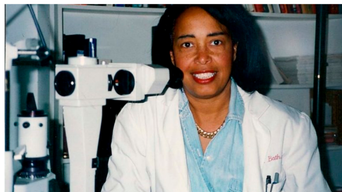
Figure 5. Patricia Bath in 1994.

Patricia Bath (Figure 5) gave many international conferences and was the author of more than 100 scientific articles.