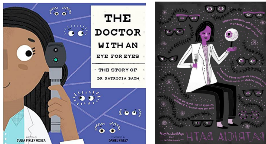
Figure 7. Covers of two books on Patricia Bath. Source: [9].