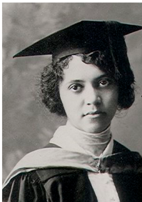
Figure 1. Alice Ball in 1915. Source: [3].

After graduating, Alice Ball (Figure 1) received two scholarships, one to study at the University of Berkeley, in California, and another to study at the University of Hawaii. She chose to move to Hawaii to study a master's in chemistry. In 1915, she was the first woman and the first African American to get a master's degree from the University of Hawaii [1].