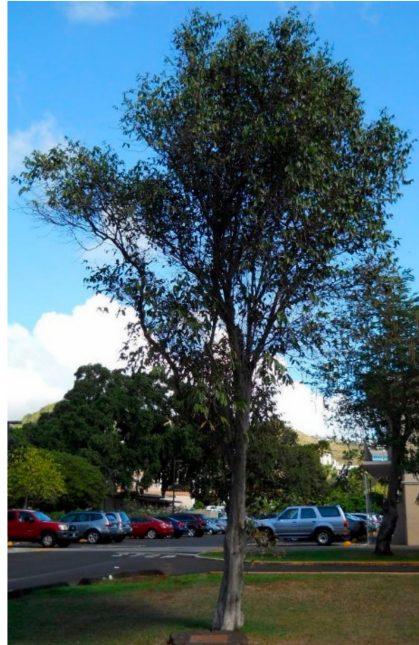
Figure 3. The chaulmoogra tree and the plaque at its feet in honor of Alice Ball.

The University of Hawaii ignored Alice Ball's work for almost 90 years, until it recognized it in 2000 and paid honor to her by dedicating a plaque with her name, located on the unique chaulmoogra tree on campus (Figure 3). On the same day, the Lieutenant Governor declared 29 February as "Alice Ball Day", which is celebrated every 4 years. In 2007 the University of Hawaii again awarded her the Medal of Distinction [3].