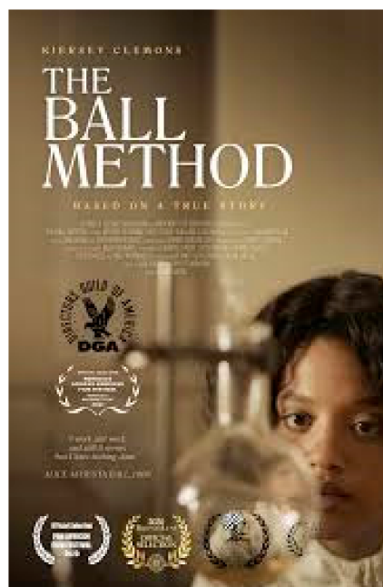
Figure 4. A book on the Ball Method.

Several publications have appeared in recent years, by different authors, glossing both her figure and her work (Figure 4).