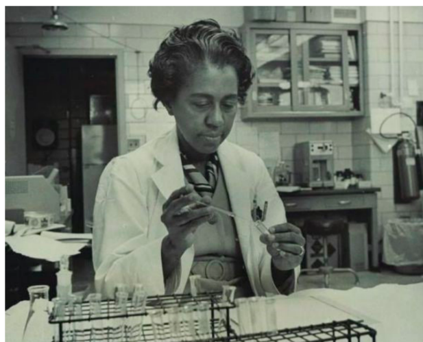
Figure 2. Alice Ball working in the lab with chaulmoogra oil.